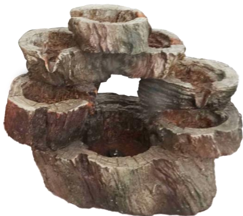
Fountain (Pump & LED lights pre-installed) 1x