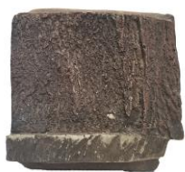
Fountain Back Door 1x