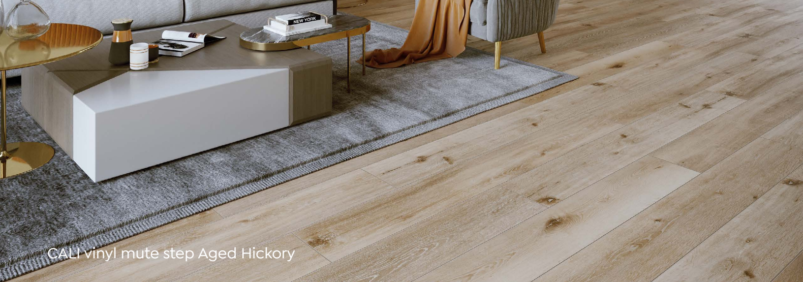
CALI vinyl mute step Aged Hickory