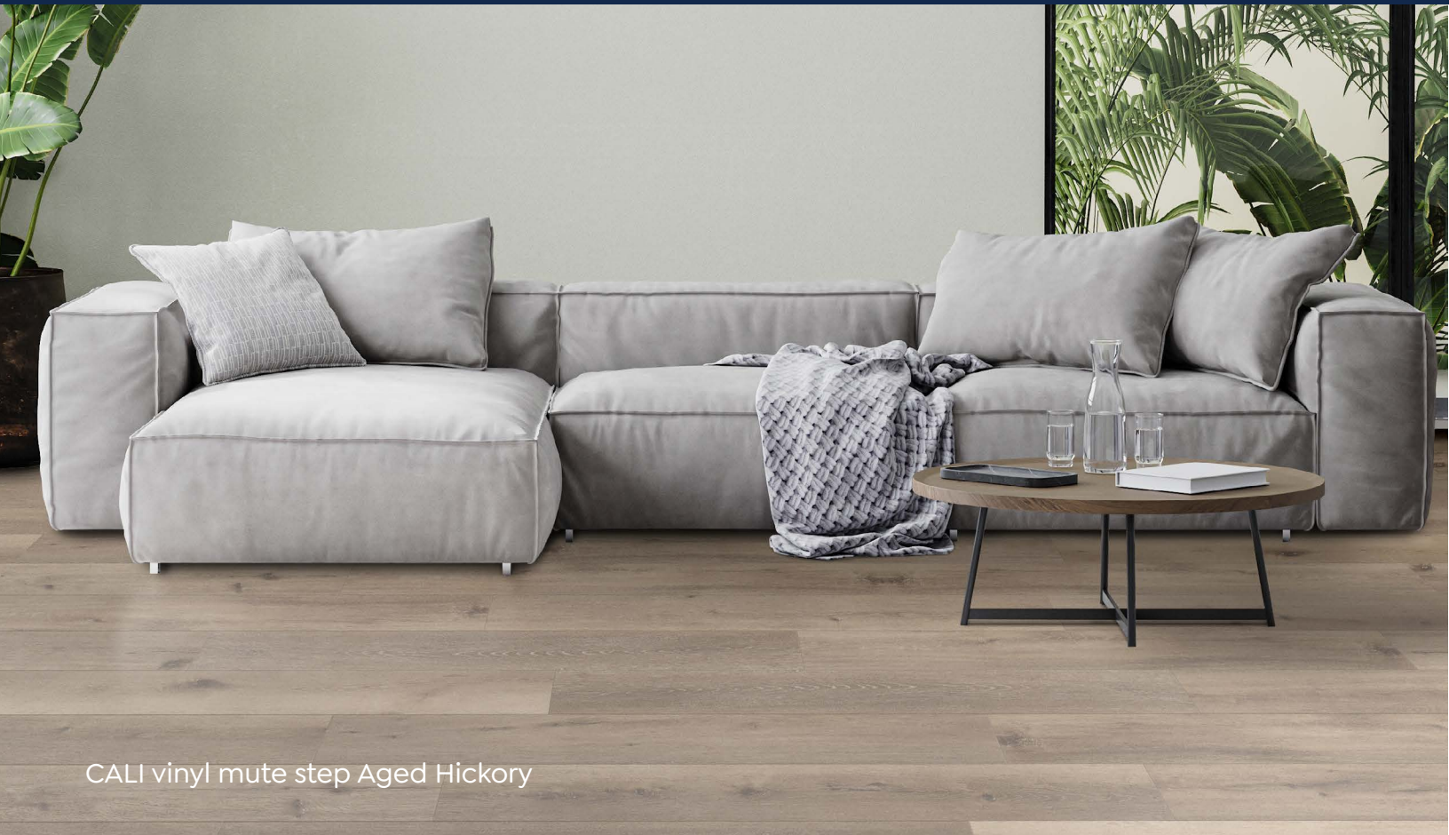
CALI vinyl mute step Aged Hickory

Cali Vinyl Pro with Mute Step delivers authentic hardwood beauty with attached acoustic padding lining each plank. This IXPE cushion improves sound insulation and provides for quieter steps and more comfortable rooms. Twenty-two coastal-inspired colors showcase intricate wood imagery and specialized embossing that matches up with the knots and grains you see. Planks are 100% waterproof and geared for commercial grade durability with a strengthening limestone composite core. Plus, an extra-thick 20mil wear layer boosts scratch protection from all the pets, kids, and party-people in your life.