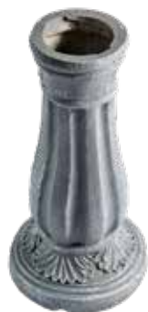
A. Pedestal Base