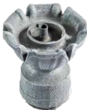
B. Tier 1 Bowl