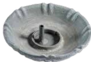
C. Tier 2 Bowl