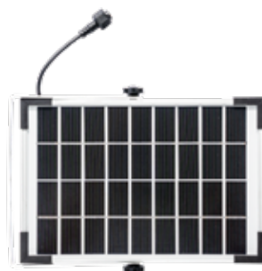
F. Solar Panel