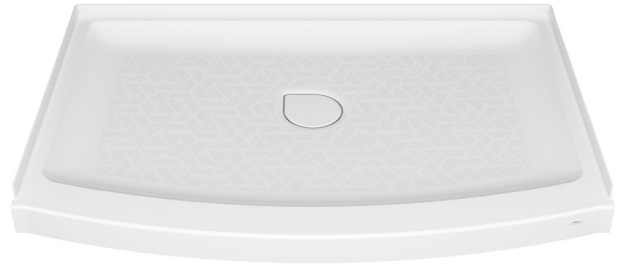
A8015T-CO SHOWER BASE Center Drain

SEE NEXT PAGE FOR ROUGHING-IN DIMENSIONS AND PRODUCT SPECIFICATIONS