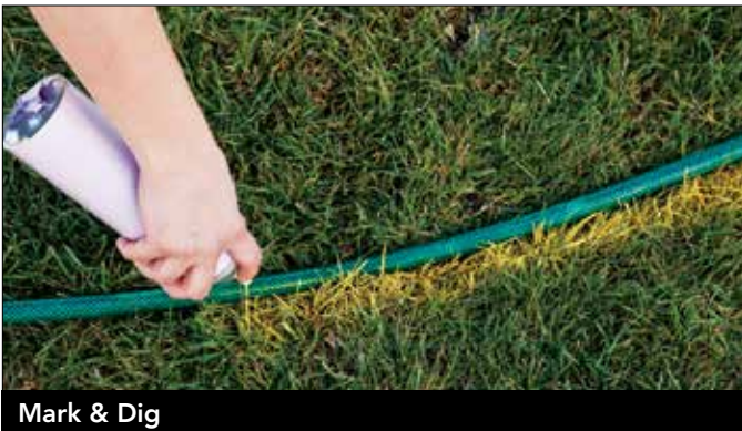
Mark & Dig

Mark an outline of your project. Then dig a shallow trench 3" deep by 6" wide to receive the edging unit.