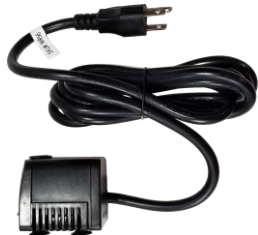
Fountain Pump x1