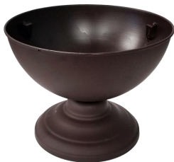
Fountain Base x1