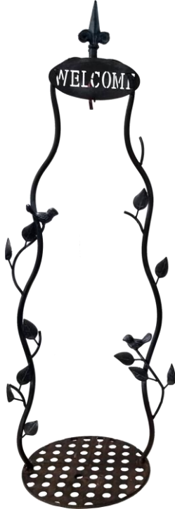
Fountain Top x1