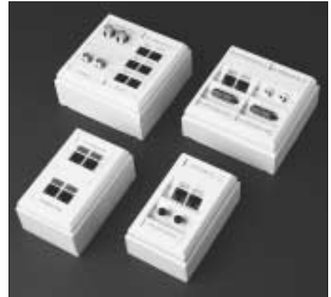
5700 Series boxes with Pass & Seymour Activate inserts.