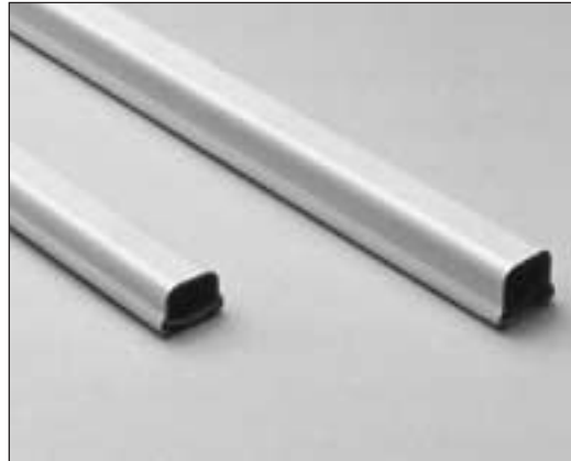
V500 and V700.

deal for surface mounting small amounts of electrical wiring or communication cables. These rugged raceways offer a low profile appearance which blend with any decor. V500, V700, and 700WH come in our exclusive ScuffCoat™ finish.