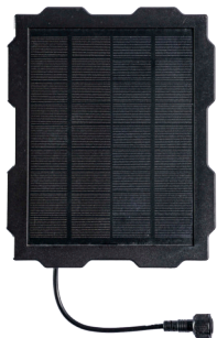
D. Solar Panel