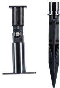
E. Ground Spike