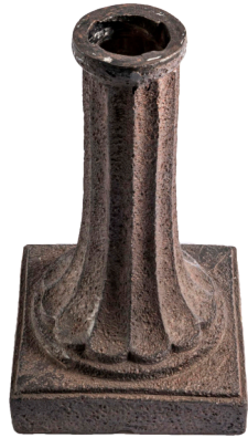
A. Pedestal Base