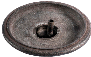
B. Tier 1 Bowl