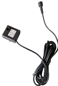
F. Solar Pump