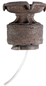
C. Top Pedestal