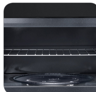
Ceramic Enamel Interior