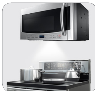
LED Cooktop Light