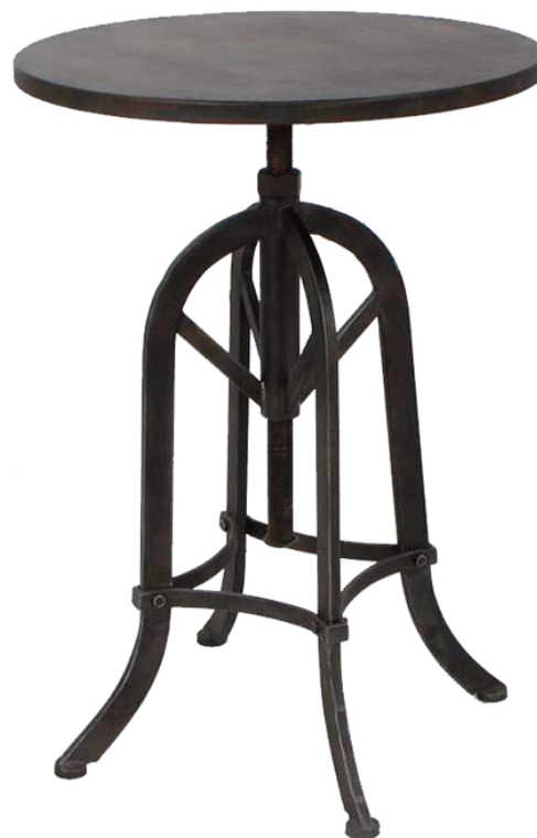
Table has a screw post winding mechanism that adjusts tabletop height from 25- to 34-inches.