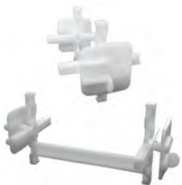
A Mortar Spacers Model #: SPACERSREG or SPACERGBU