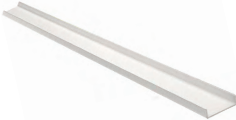
D Perimeter Channel Model #: VPC4