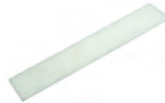
C Expansion Foam Model #: FOAMEXP3