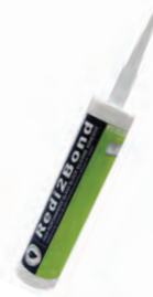
C Redi2Bond Silicone Model #: R2BSIL