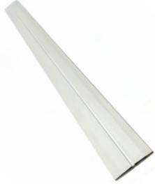
A Horizontal Spacer Model #: PVHORSP