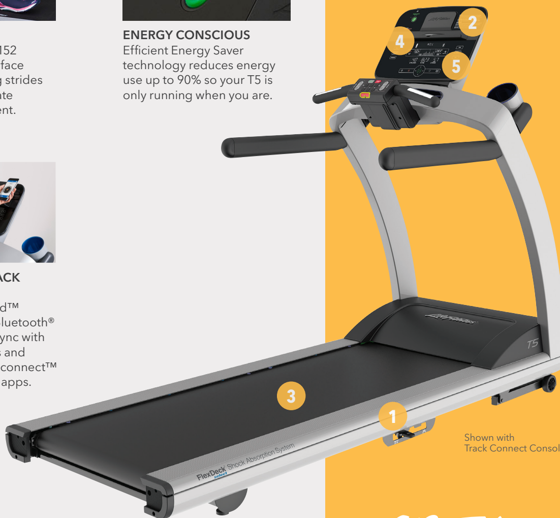
Shown with Track Connect Console

Choose between the engaging and interactive Track Connect console and the intuitive Go Console.