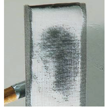
Other low-dust products can clog, polishing the finish and leading to paint flashing.