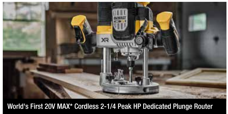
World's First 20V MAX* Cordless 2-1/4 Peak HP Dedicated Plunge Router