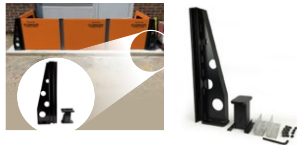
2-way and 3-way stanchions available to join multiple units together to create wider protection or U-shape around doorways

Sliders typically do not offer enough depth to fit. They often jam. You can either use the corner stanchion or side rails to create a secure area for gates to go in outside.