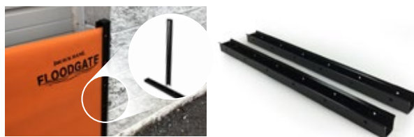
Side Rails for uneven surfaces