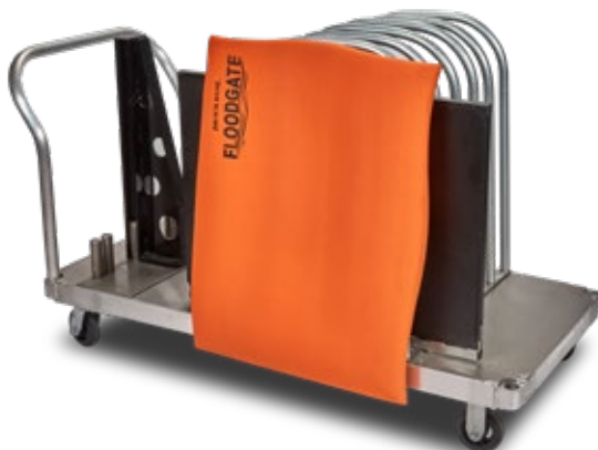
Flood Gate Cart for ease & speed of storage & deployment Holds 7 Flood Gates & 4 Stanchions