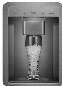
Tall Dispenser Design