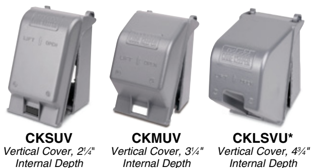
CKSUV Vertical Cover, 2 1/4\"/>

Red Dot® Code Keeper® Universal While-in-Use Covers make it easier than ever to comply with National Electrical Code (NEC) requirements for weatherproof while-in-use covers in wet locations. Preconfigured for GFCI — the industry's most common configuration — each cover ships with adapter plates to accommodate single or duplex receptacles and switches. Now contractors can handle any application they encounter without needing dozens of different covers.