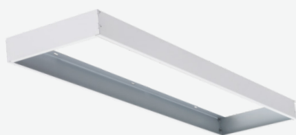
Surface Mount Kits