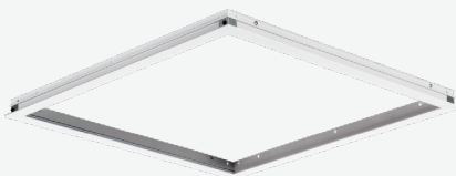
Drywall Adapter Kits