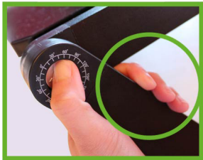
When adjusting be wary of your fingers