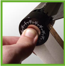
Depress the button to adjust the leg.

The joint is locked when the button is extended. Only use WorkEZ when all joints are locked.