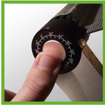
An extended button means the joint is locked.