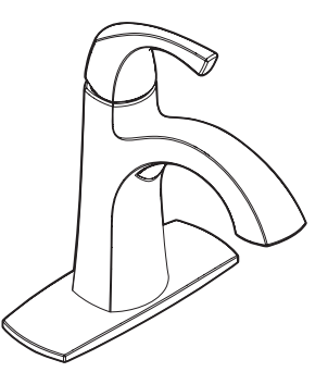
Lindor™ One-Handle Lavatory Faucet