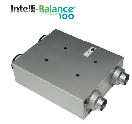
FV-10VEC2<sup>2</sup> (Cold Climate) FV-10VE2 (Temperate Climate)