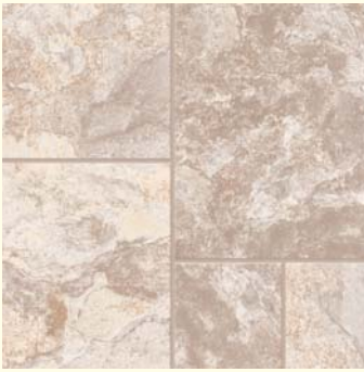
72000 Corn Silk