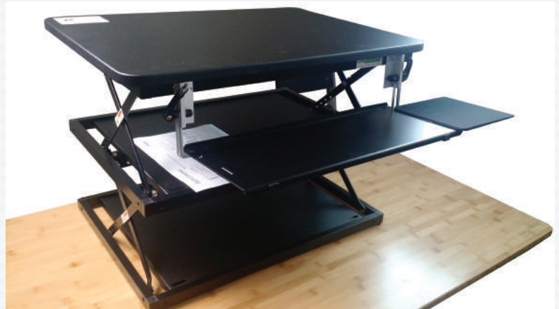
Properly installed keyboard tray.

CHANGEdesk features an adjustable-height keyboard tray that connects to the metal frame directly below the top wooden panel.