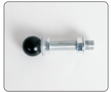
tooth rod, black round ball, soft rubber spacer