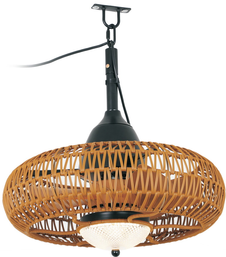
FAN : 230903A1