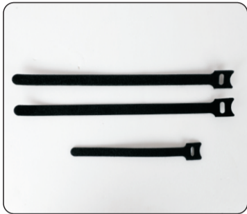
long+short nylon tie