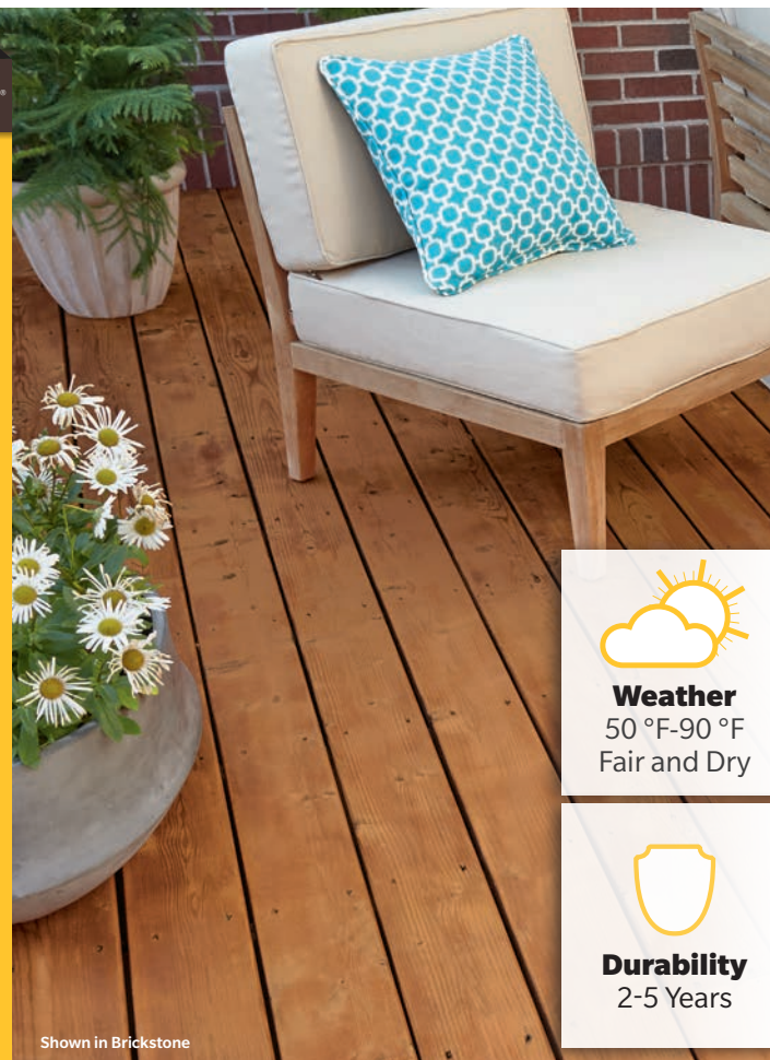
Shown in Brickstone