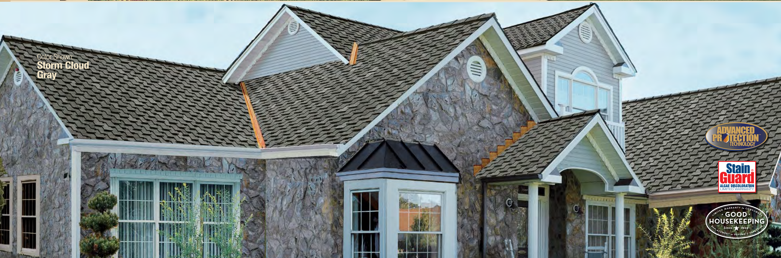
Color Shown: Storm Cloud Gray

Note: It is difficult to reproduce the color clarity and actual color blends of these products. Before selecting your color, please ask to see several full-size shingles.