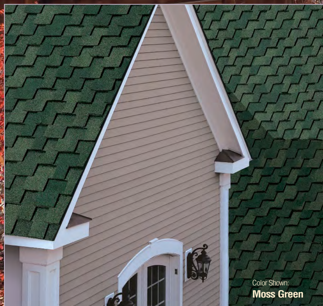
Color Shown: Moss Green