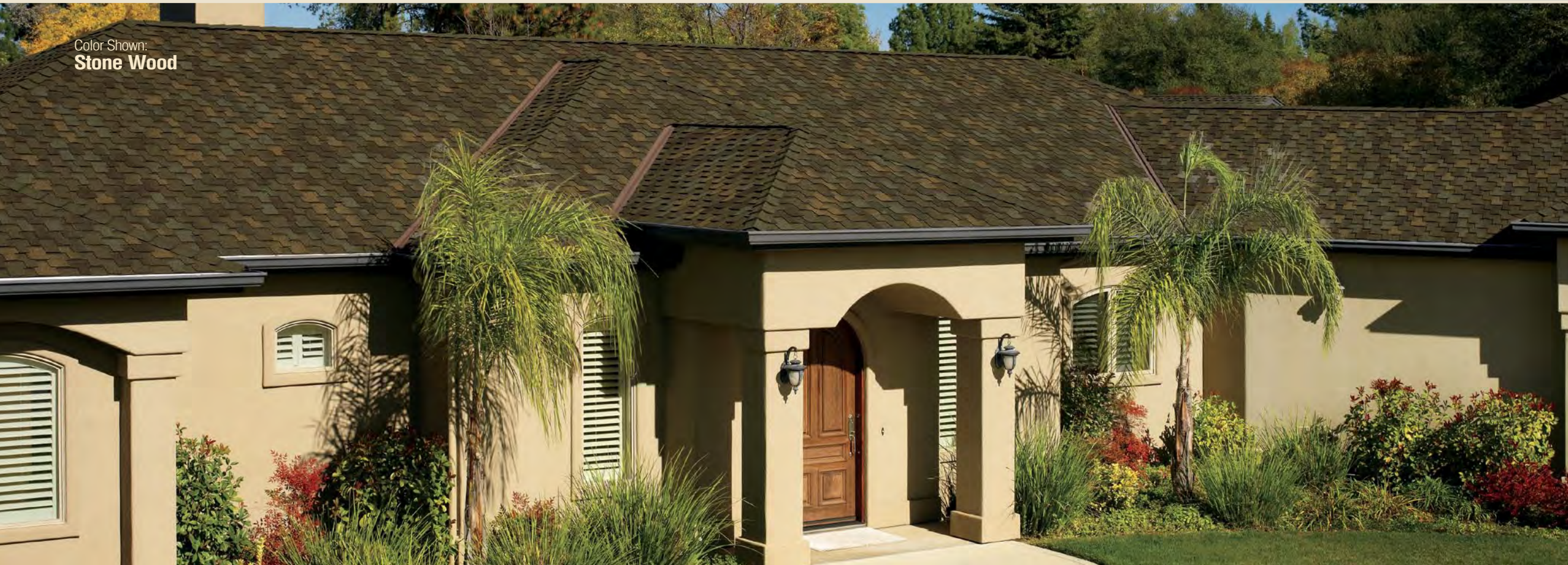
Color Shown: Stone Wood

"The incredible depth and dimension of Grand Canyon® Shingles will astound even the most casual observer!"