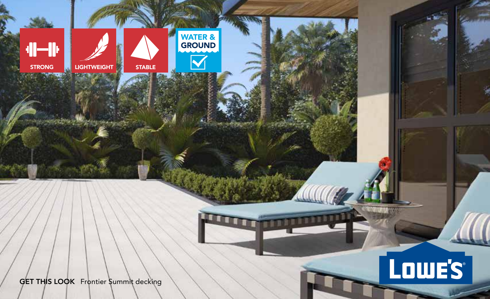
GET THIS LOOK Frontier Summit decking