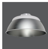
ALR Aluminum Reflector