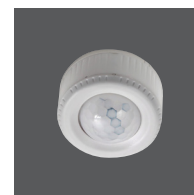
SENSOR Plug in sensor