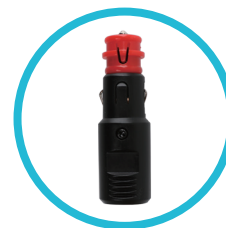
SAE TO CIG CABLE