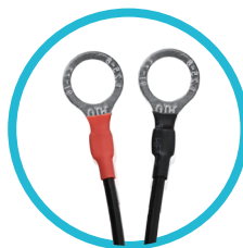
SAE TO RING CABLE