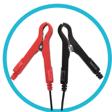
SAE TO ALLIGATOR CABLE