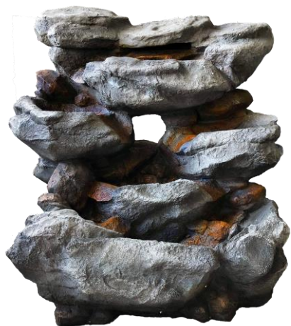
Fountain (5 LED lights pre-installed) 1x