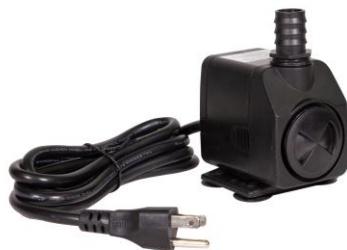
Fountain Pump 1x