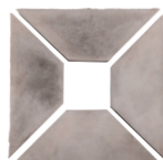
22" Split Cap