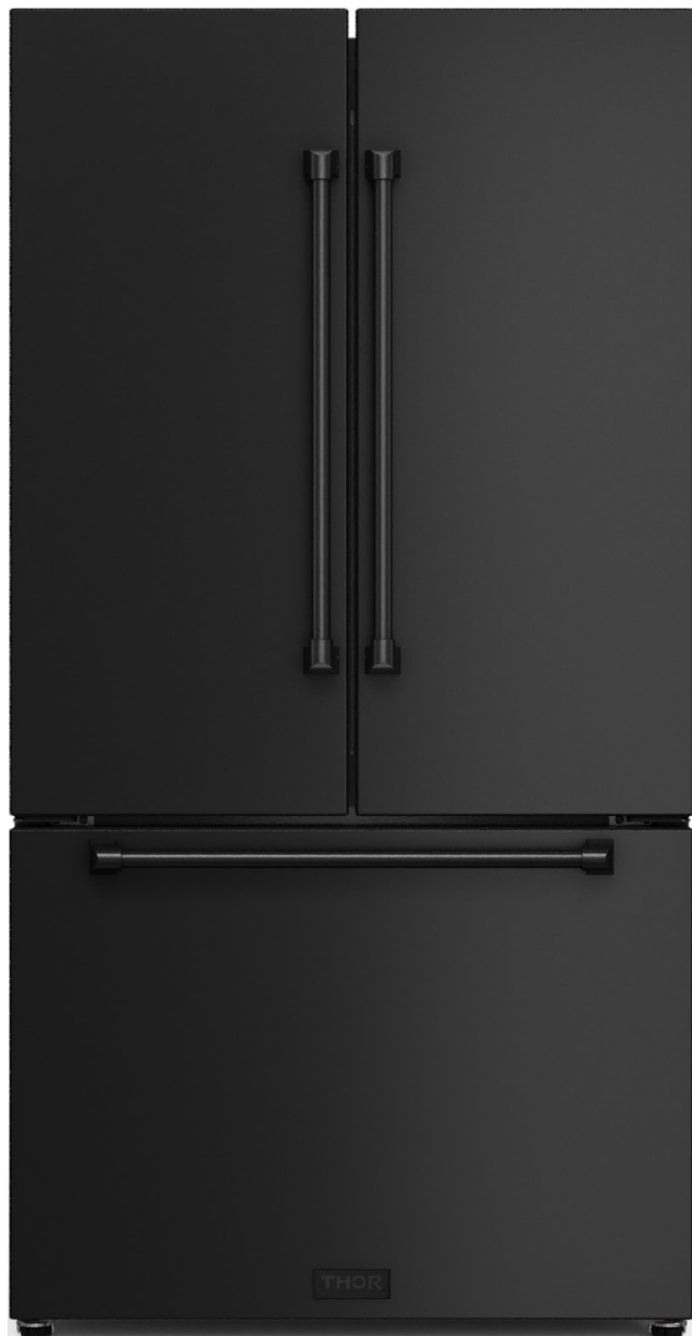
Product: Gordon Ramsay by THOR Kitchen 36 Inch 20.3 Cu Ft French Door Counter Depth Refrigerator With Ice Maker In Matte Black Model Number: RF3621CTD00