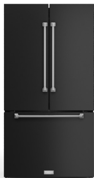
STAINLESS STEEL RF3621CTD00-SS