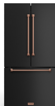
ROSE GOLD RF3621CTD00-RSG