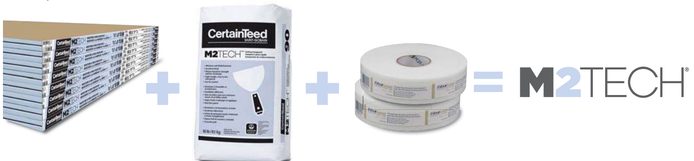
CertainTeed M2Tech Gypsum Board

M2Tech systems protect against moisture and mold in a lower cost system solution versus paperless products. These systems promote healthy indoor air quality when used in new construction and renovations over wood or steel framing in dry areas or areas with limited water exposure.