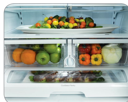
CoolSelect Pantry™ with Temperature Control