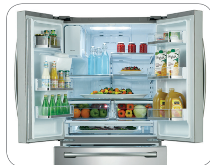
French Door Design