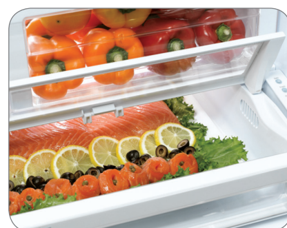
CoolSelect Pantry™ with Temperature Control