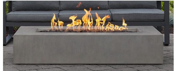
Available in flint (143LP-FLNT)