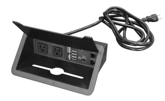
STEP 1a: Insert Power/ Data Port(B) into tabletop cutout.