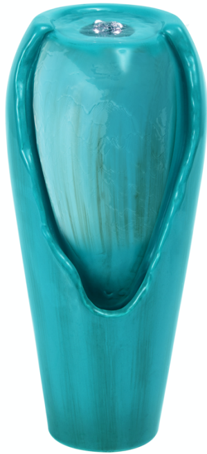
Fountain (LED light pre-installed) 1x