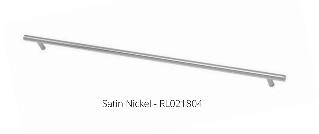
Satin Nickel - RL021804