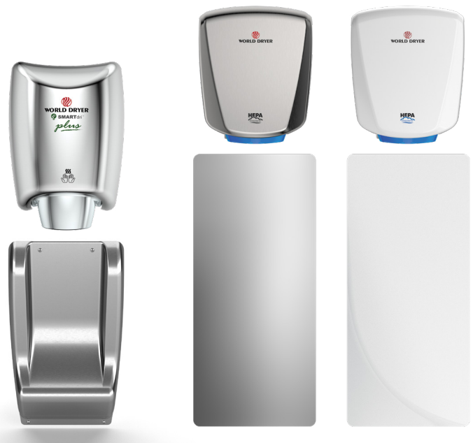
ADA WALL GUARD BRUSHED S/S