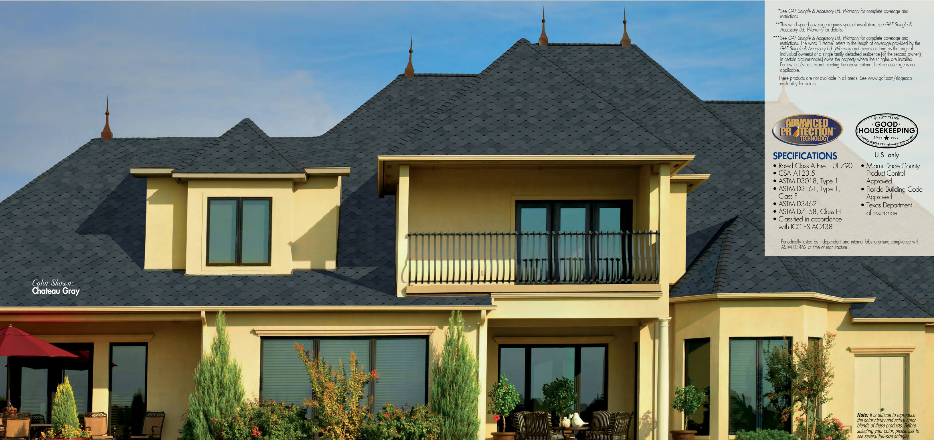
Color Shown: Chateau Gray

1 Periodically tested by independent and internal labs to ensure compliance with ASTM D3462 at time of manufacture.