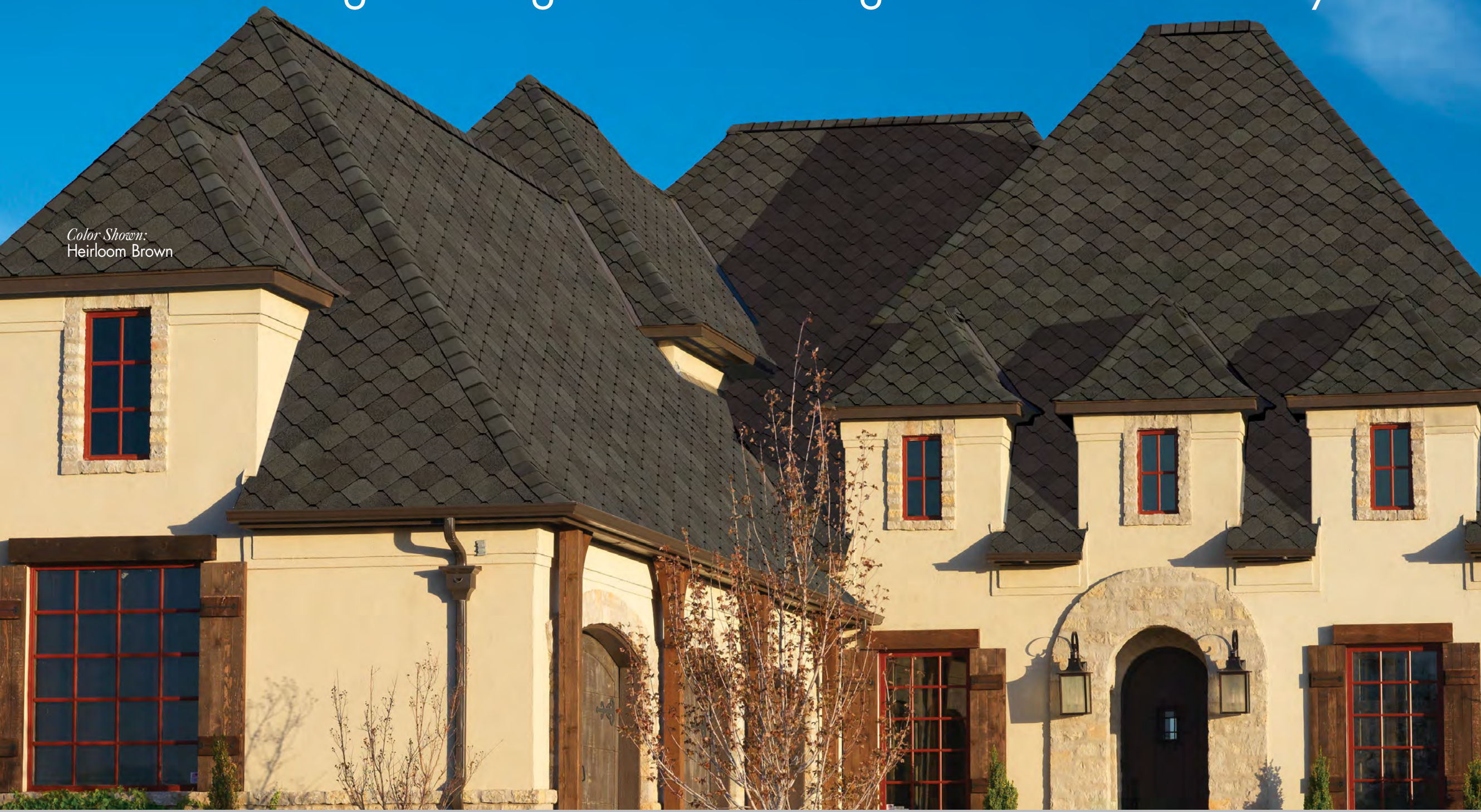
Color Shown: Heirloom Brown

A classic design offering Old World elegance—at an incredibly affordable price