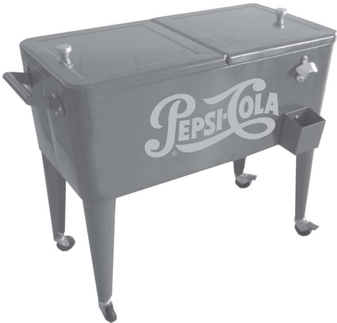
STEEL 80QT COOLER

Monday-Friday 8:00am-5:00pm (Pacific Standard Time)