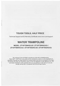
Instruction Manual x1