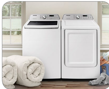
Large 4.5 cu. ft. Capacity