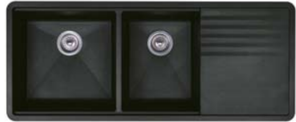
MODEL 221-071 Shown