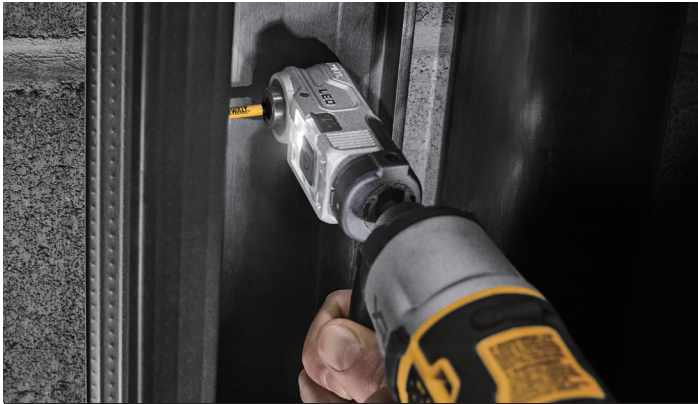
Integrated LED delivering up to 3 hours of run time on a full charge†