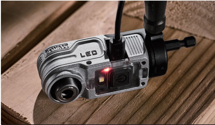
Rechargeable battery (USB cable included)