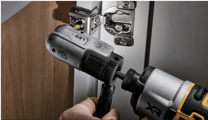
Forged gears for 10X Longer Life*

†LED is usable for 3 hours of runtime on a full charge.