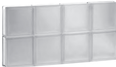
FROSTED PATTERN (FR)

MAXIMUM LIGHT, NO DISTORTION, FULL TRANSPARENCY