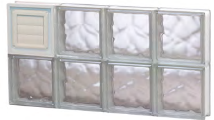
DRYER VENTED (D)

WAVE / ICE / DIAMOND / FROSTED / CLEAR: WHITE COLORED VENT BRONZE WAVE: CLAY COLORED VENT