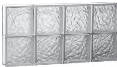
ICE PATTERN (IS)

MODERATE LIGHT WITH HIGH DEGREE OF PRIVACY