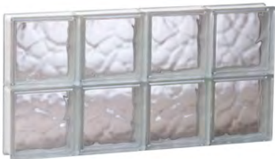
WAVE PATTERN (DC)