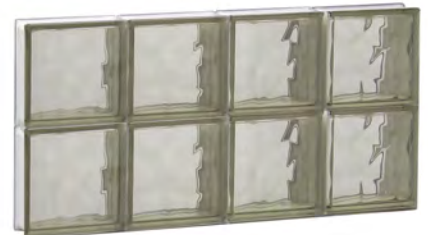
BRONZE WAVE PATTERN (BZ)

(PRIVACY LEVEL SLIGHTLY REDUCED WHEN WET)