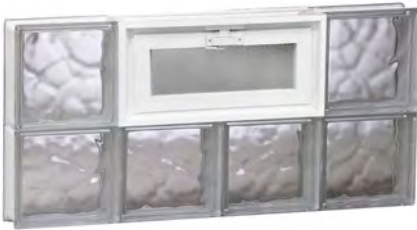
FRESH-AIR VENT (V)