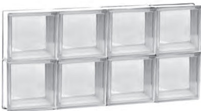
CLEAR PATTERN (CL)

MAXIMUM LIGHT, NO DISTORTION, FULL TRANSPARENCY