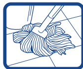
Pour into Bucket

Not for use on: Wood, marble, granite, natural stone, painted or stained concrete, glazed ceramic tile and newer no-wax vinyl floors