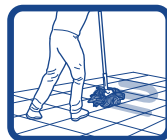
Apply using "Figure Eights"