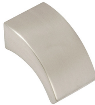
Satin nickel - RL060315