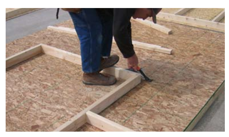
33. Continue fastening the wall.