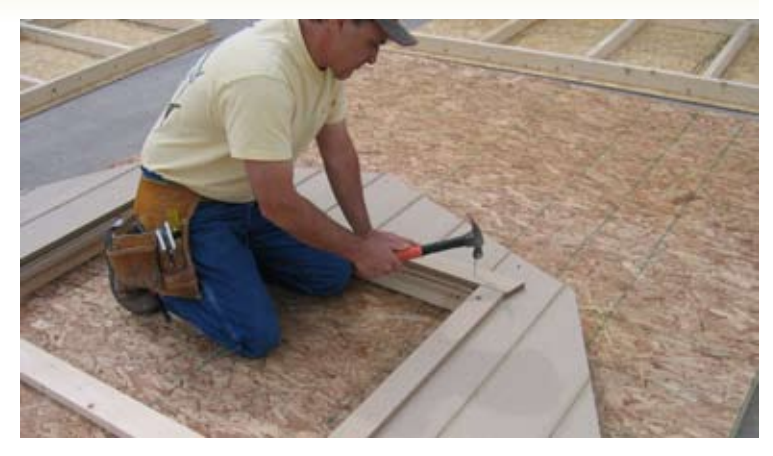
49. Install the 2 3/4" trim around the door and secure with 2" nails.