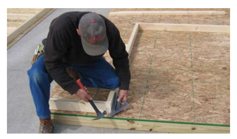
32. Secure 2x4 plates as shown with 3" nails. Make sure it is flush.