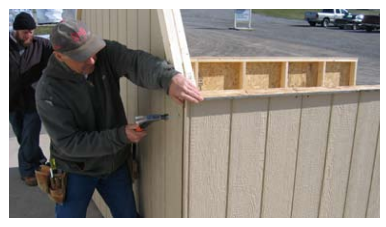
69. Make sure the walls fit nice and tight and fasten with 2" nails every 8".