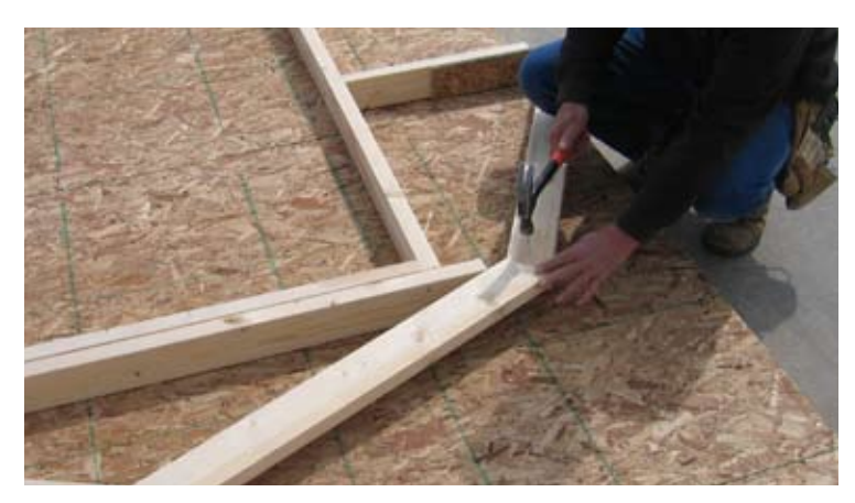
39. Nail the truss on top of the 2x4 where notched.