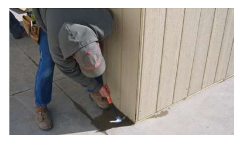
70. Fasten the bottom with 2" nails every 8 inches.