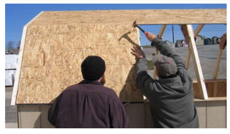
91. Continue with the sheeting.