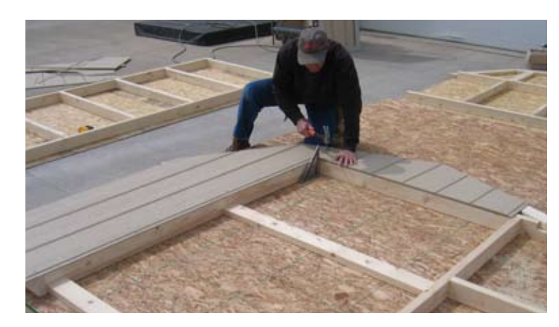
45. Install the top section of Smart side.