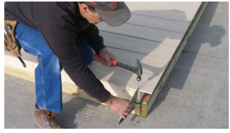
11. Continue installing Smartside siding. There will be a 3" skirt at the bottom.