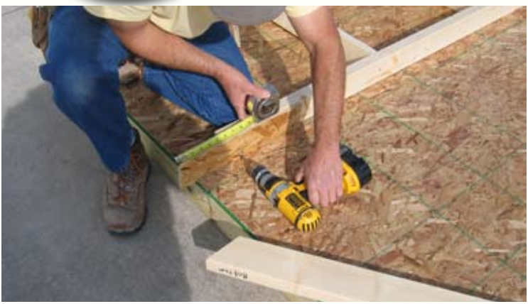
24. Temporarily install the piece of 7/16 \times 3 \cdot 1/2 \times 20 \circ SB to to the top plate. Measure out 5 1/2" from the edge of the top plate as shown, and fasten.