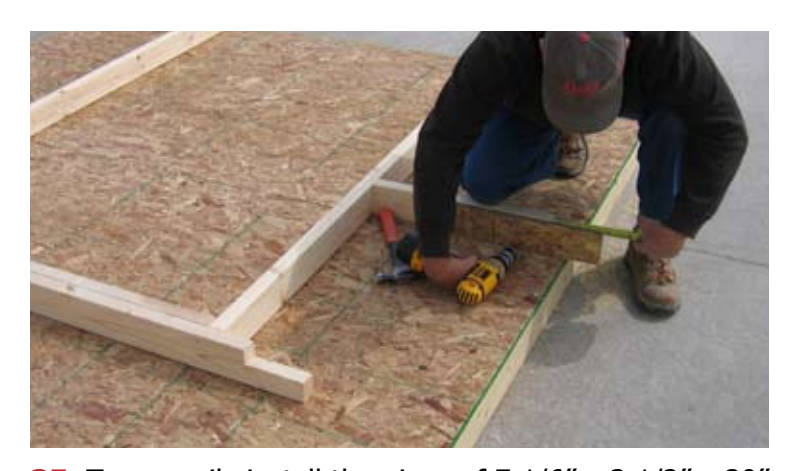
35. Temporarily install the piece of 7 1/6" x 3 1/2" x 20" OSB to the 2x4 that is attached to the middle of door, as shown. Measure out 5 1/2" and fasten with 1 1/4" blackheaded screws. Repeat on other side.