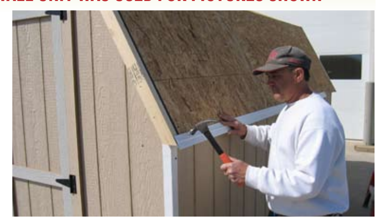
103. Next you are going to install the drip edge. This will be fastened with 3/4" nails.