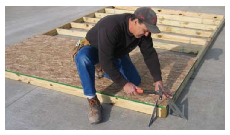
5. Set OSB sheeting in place, using the speed square, make sure the OSB is flush with the 2x4 on both sides.