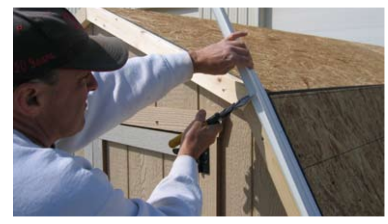
105. As you secure the drip edge, you will need to snip the drip edge to allow it to bend along the ridge.