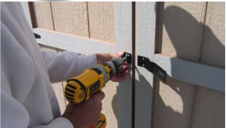
102. Continue with the latch.