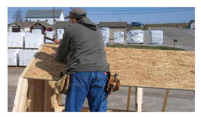
86. Now fasten the top outside corner.