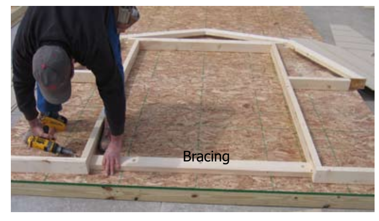
40. Install 48" or 60" (depending on door width) 2x4's, flat, for temporary bracing. Secure with 2 1/2" screws.