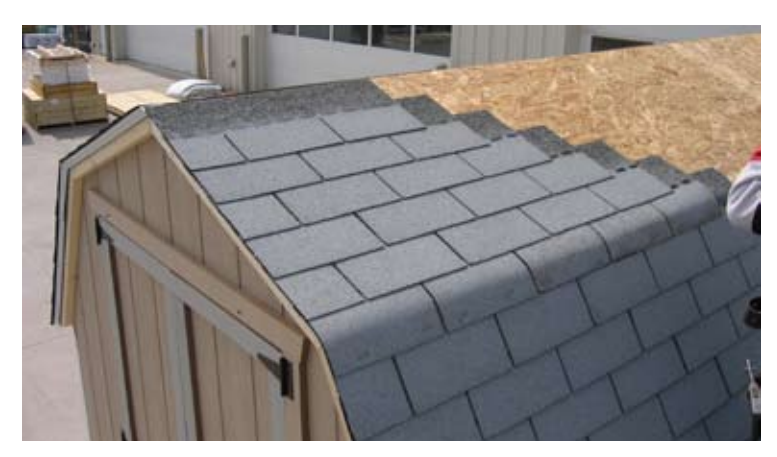
111. Continue attaching shingles to the top of the roof section, staggering as shown.