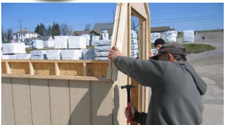
72. Fasten with 2" nails every 8".