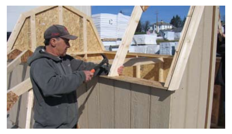
80. Secure with 3" nails where marked. Put a nail on each side and on the front.