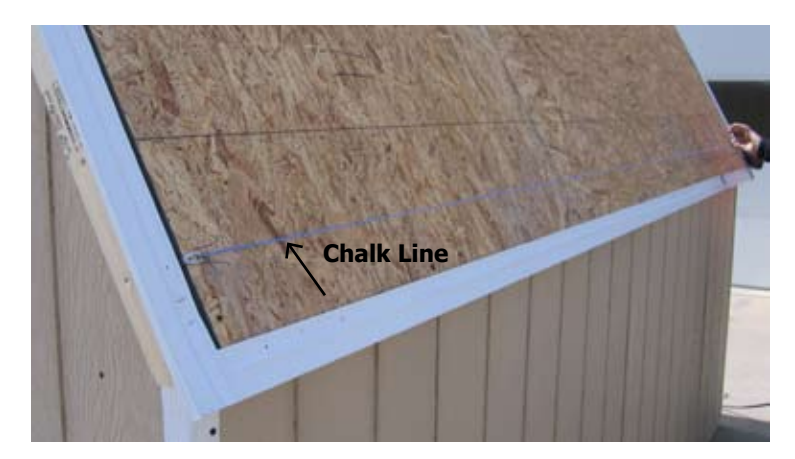
107. Now, snap a chalk line along the OSB consistent with the width of the starter strip. Consult the instructions provided with your shingle package.