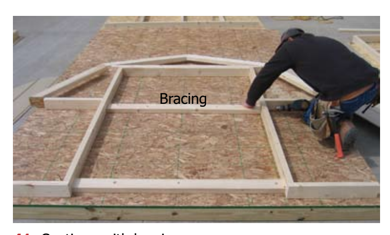
41. Continue with bracing.