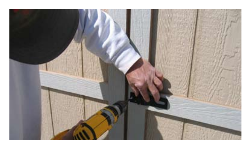
101. Now install the latch on the door.