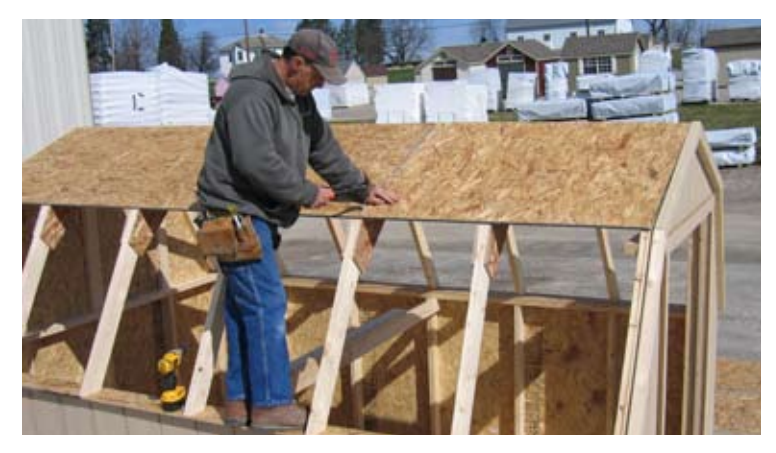
87. Continue with OSB Sheeting and fasten every 6" to 8" with 2" nails.