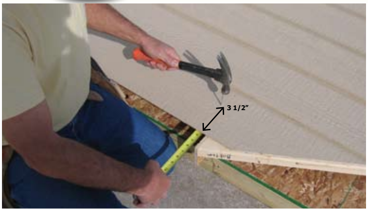
30. Measure 3 1/2" out from the edge of the 2x4 plate and secure with 2" nails.