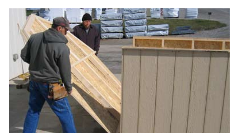
68. Next install gable wall.