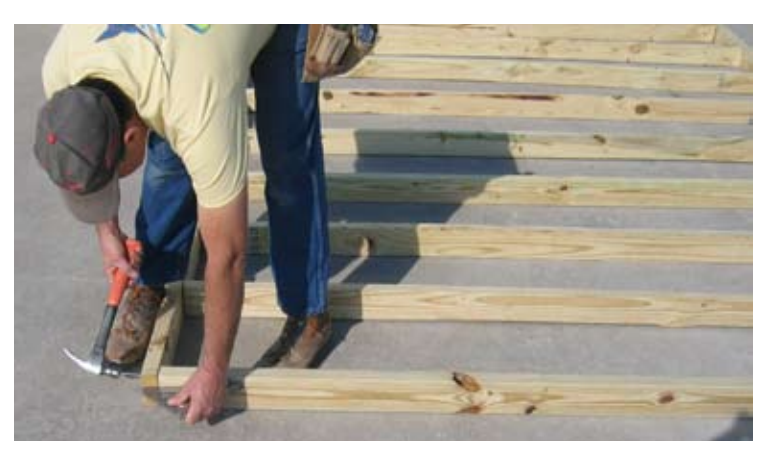
3. Start at the corner and use the speed square to make sure the corner is flush and fasten with 3" nails.