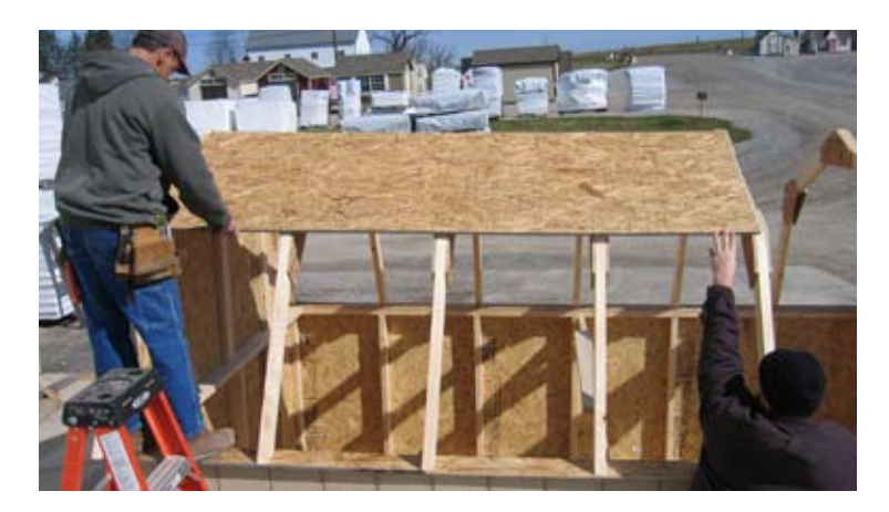
82. Install the first piece of sheeting as shown.