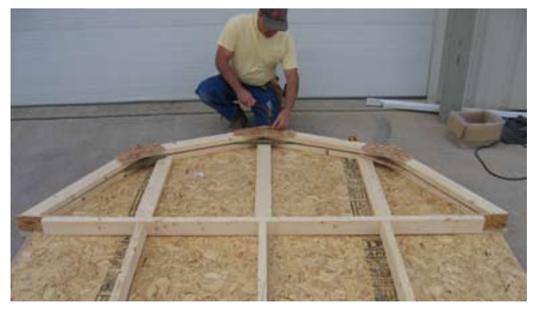
64. Continue assembling trusses till all trusses are complete.