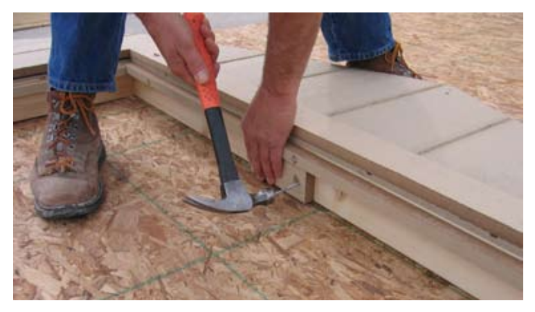
50. Install the trim block in the center of the header, and secure with 2" nails.