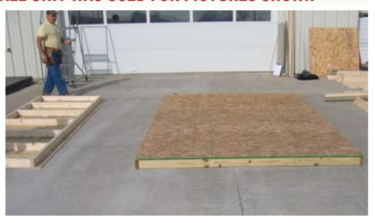
20. Lay wall off to the side as shown.