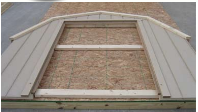
54. Make sure the rakes are all installed and fastened with 3" nails.