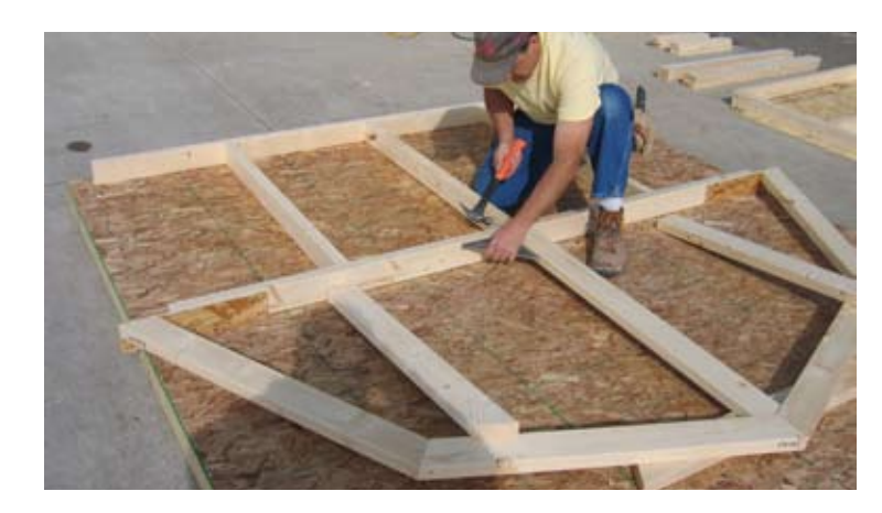
27. Place the gable studs and fasten with 3" nails.