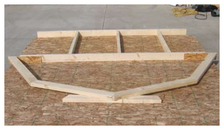
26. Now it is ready for gable studs. *Refer to your WALL DIAGRAM Sheet for your particular layout.