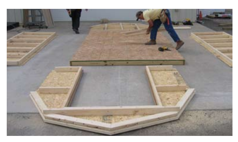
57. Lay wall off to the side.