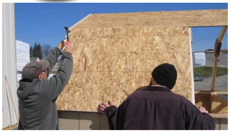
90. Continue with sheeting.