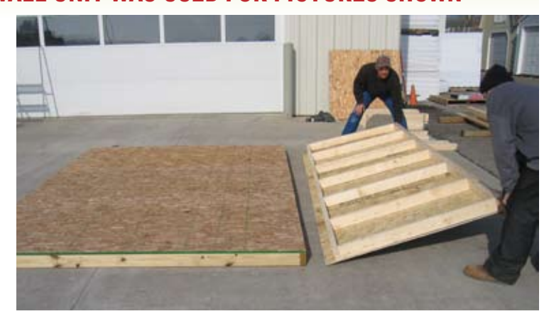
14. Lay wall off to the side as shown.