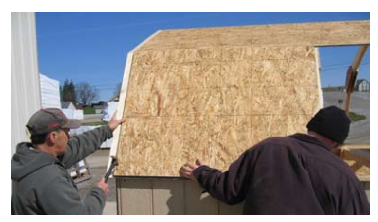
89. Fasten with 2" nails.