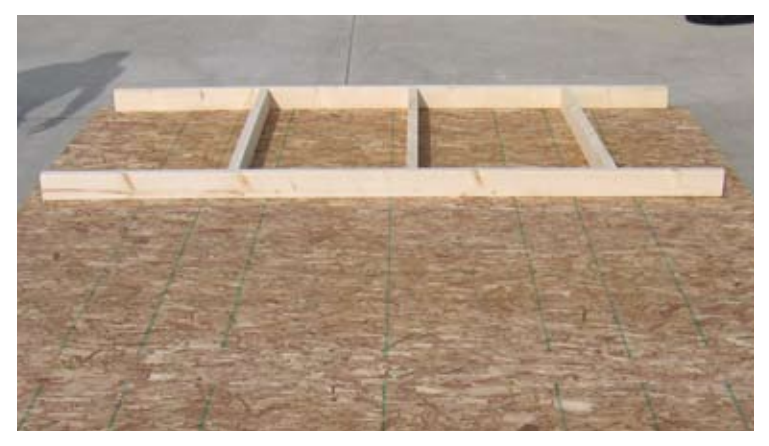
21. Using the WALL LAYOUT DIAGRAM sheet. Locate the back wall plates, and studs, and lay them out as shown in the diagram.