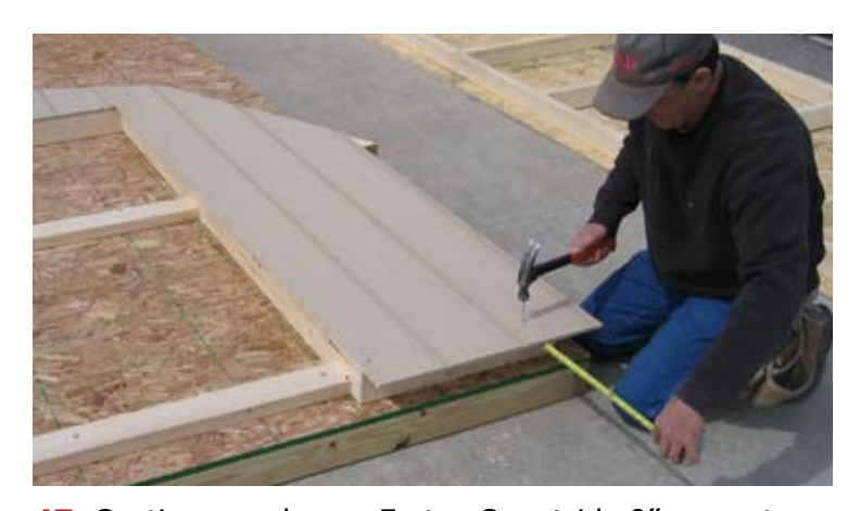
47. Continue as shown. Fasten Smartside 8" on center.