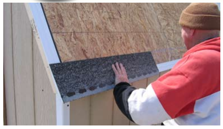
108. Align the top of the starter shingles with the chalk line and attach.