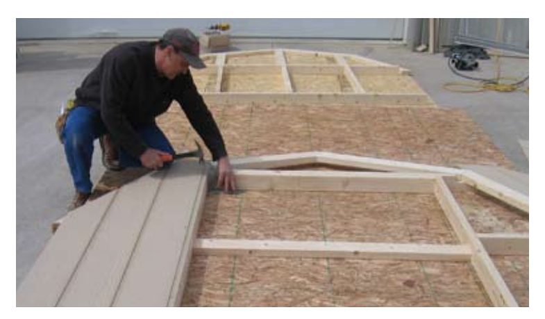
44. Make sure the Smartside is flush on the inside of the 2x4 as shown and secure with 2" nails.