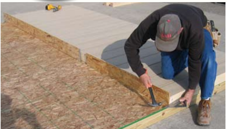
13. Make sure the OSB top plate is flush on the bottom side (inside of wall), and the side.