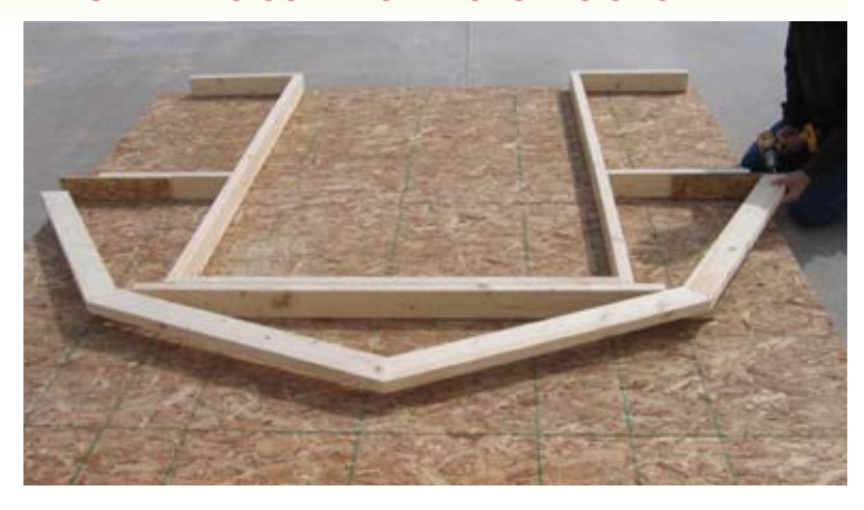
37. Next place the truss as shown and fasten with 1 1/4" blackheaded screw.