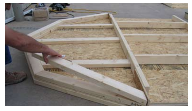
58. Next locate all truss parts, and using the previously assembled gable truss, as a template, layout the trusses.