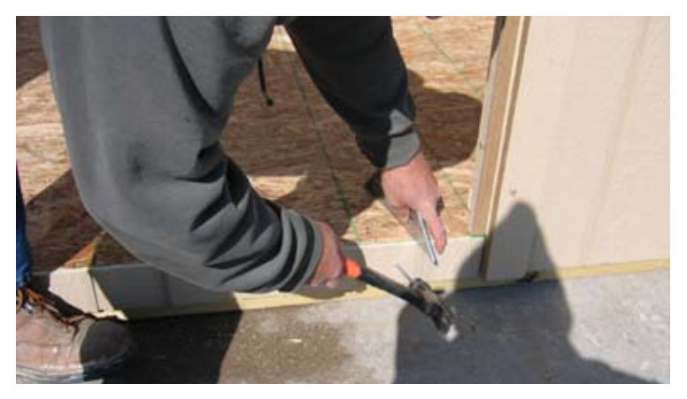
74. Install kick plate. Keep flush with top of floor and fasten with 2" nails.