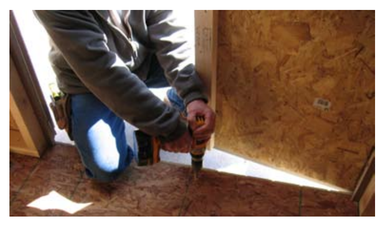
99. Now use your 5/16" drill bit to drill the hole.