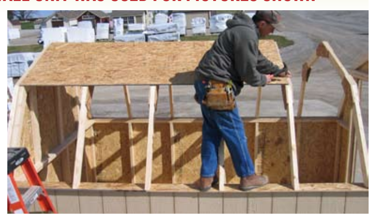
85. Make sure the trusses are 24" on center before fastening.