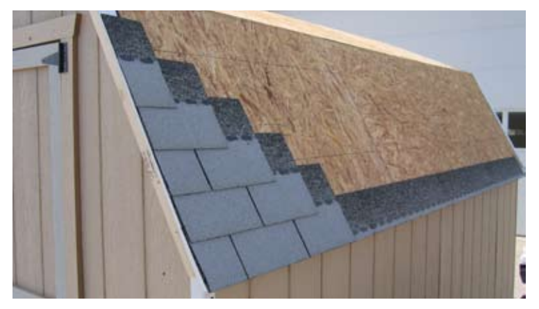
110. Continue to install shingles in a staggered fashion.