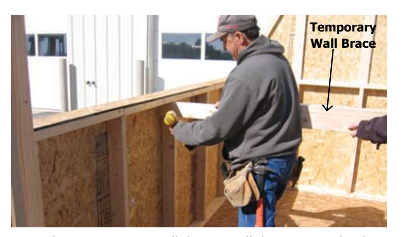
77. The temporary wall brace will be removed when building assembly is completed.