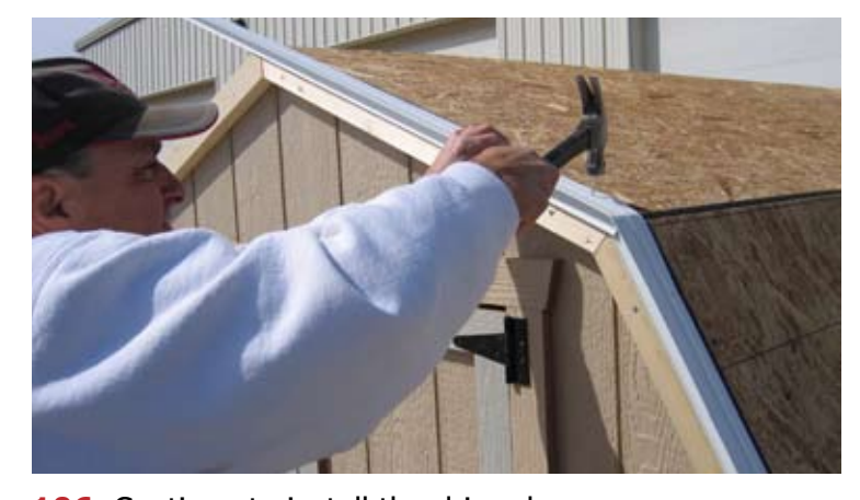
106. Continue to install the drip edge.