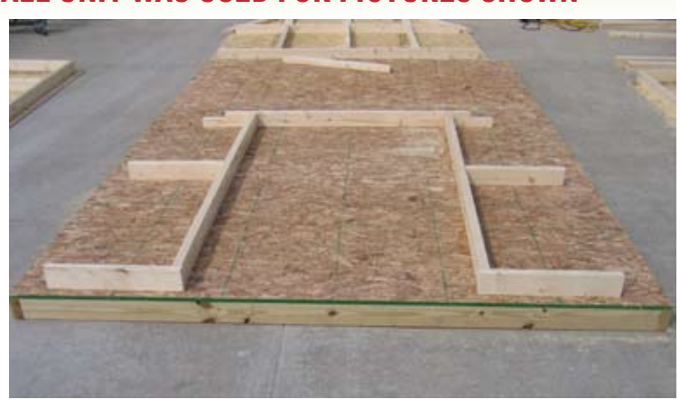
31. Next layout 2x4's, as shown for the door wall. See wall layout for correct measurements.