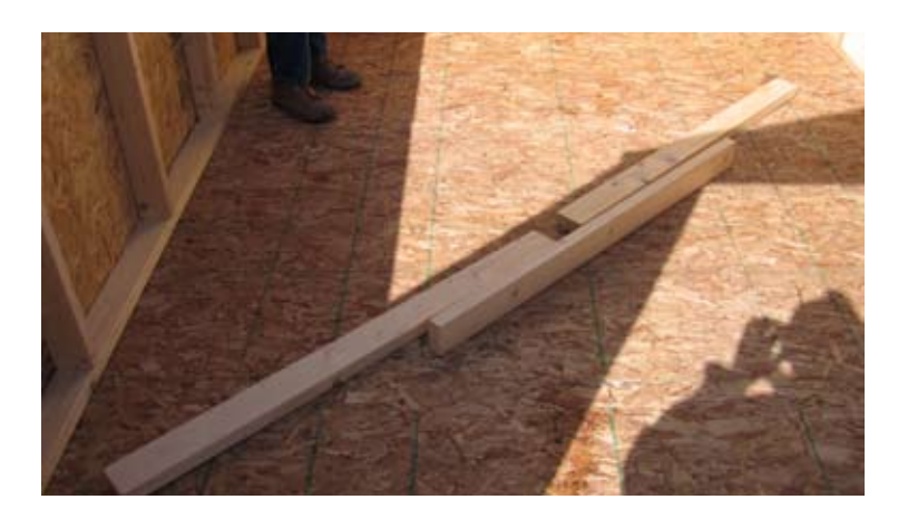
75. Locate the temporary wall braces.