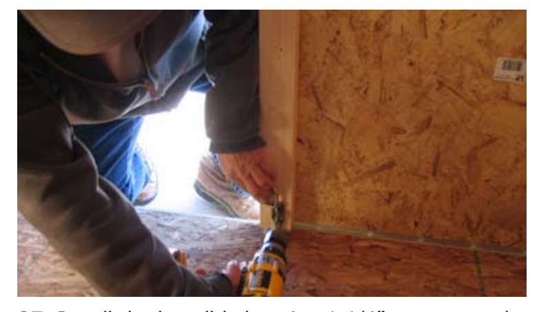
95. Install the barrell bolt, using 1 1/4" screws, on the inside of the left hand door (facing).