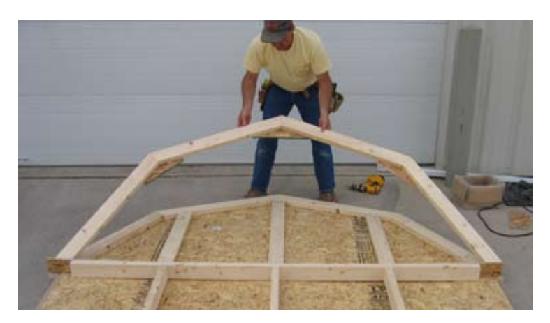
62. Lay truss in place.