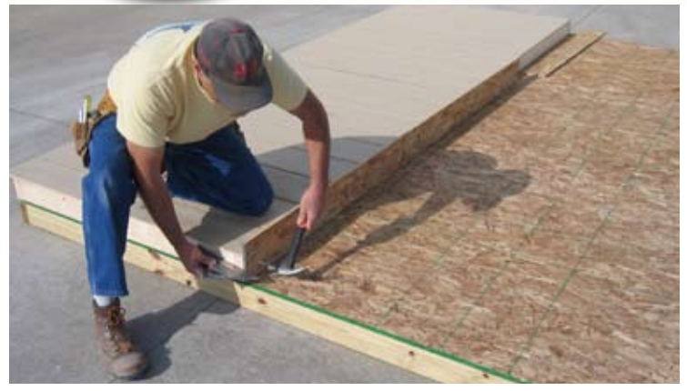
19. Install the 7/16 OSB as shown. Making sure the OSB top plate is flush on the bottom side (inside of wall), and side.