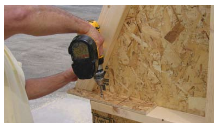
56. Remove 7/16 x 3 1/2 x 20 OSB.