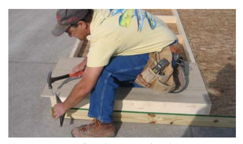
18. Continue installing the Smartside siding.