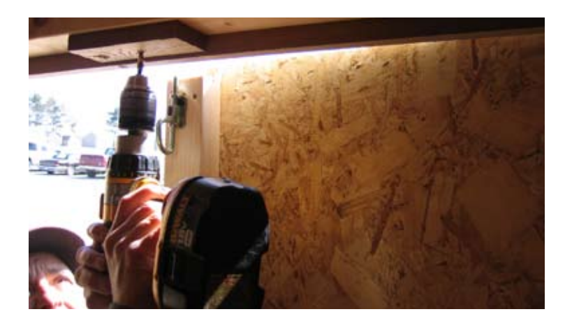
100. Again, do the same for the top.