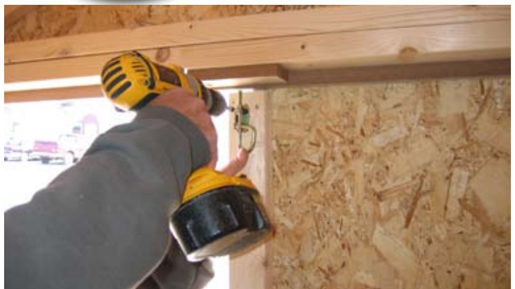
96. Then install the barrel bolt at the top of the door.