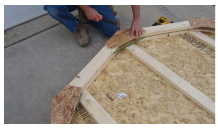
63. Now install OSB gussets on opposite site, using the 2" nails to finish truss assembly.