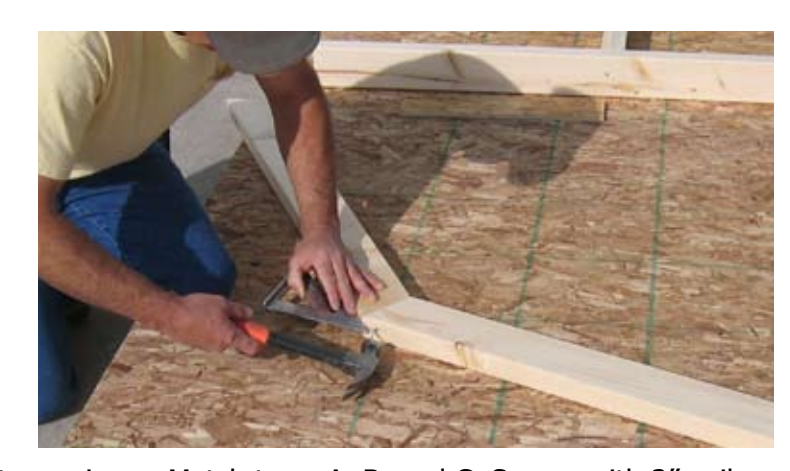
23. Using the WALL LAYOUT DIAGRAM sheet.. Locate the truss pieces. Match truss A, B, and C. Secure with 3" nails.