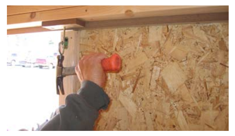
98. Do the same for the top.