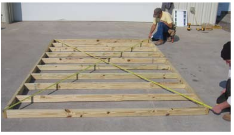
4. Next square up the floor. To square the floor, use a tape measure to find the distance from one corner to the other, then measure the diagonal between the remaining 2 corners. If the two measurements are the same, then your floor is already squared. If they aren't, adjust the the floor until the measurements are the same.