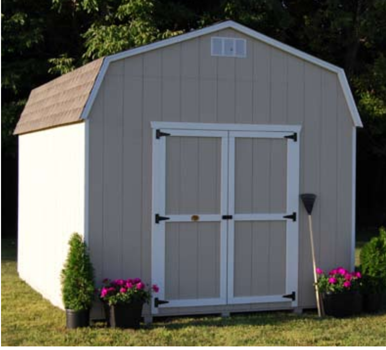
4' Value Gambrel