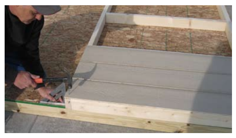
9. Next locate the Smartside Siding. Place the siding on top of the 2x4 studs as shown, making sure the top, and sides, are flush. Secure it with 2" nails.