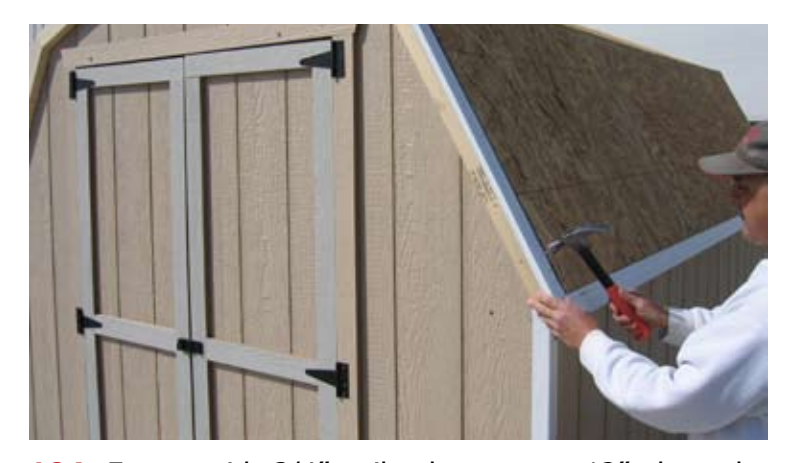
104. Fasten with 3/4" nails about every 12" along the entire edge of the building.