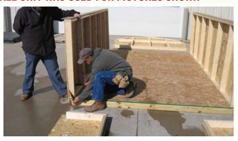
67. Continue with walls.