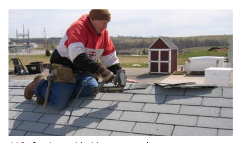
113. Continue with ridge caps as shown.