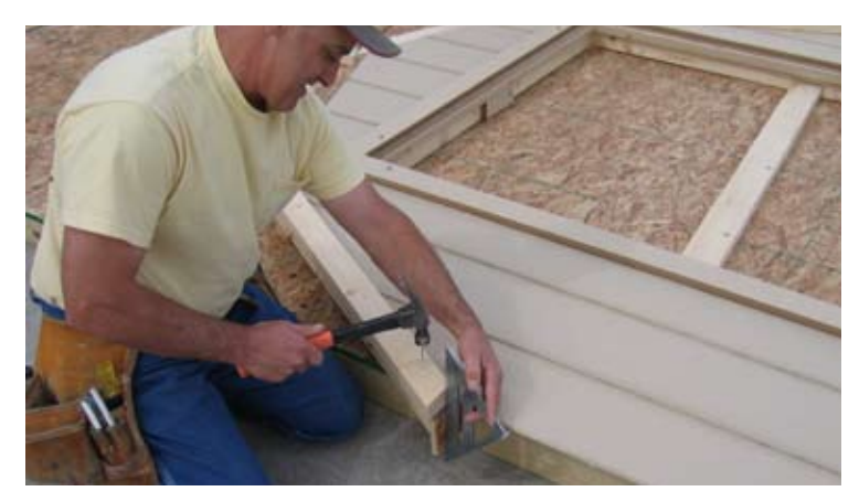
53. Now install the 2x3 rake. Install at 2 1/2" marks so the 2x3 will be flush with the 7/16 OSB roof sheeting once installed.