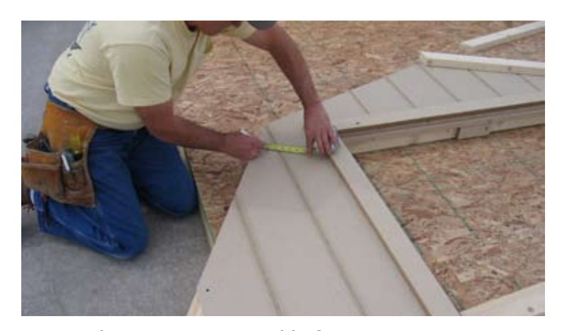
52. Do the same as pictured before.