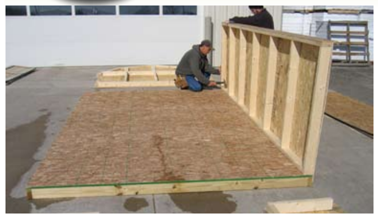
66. Fasten opposite end same as last picture.