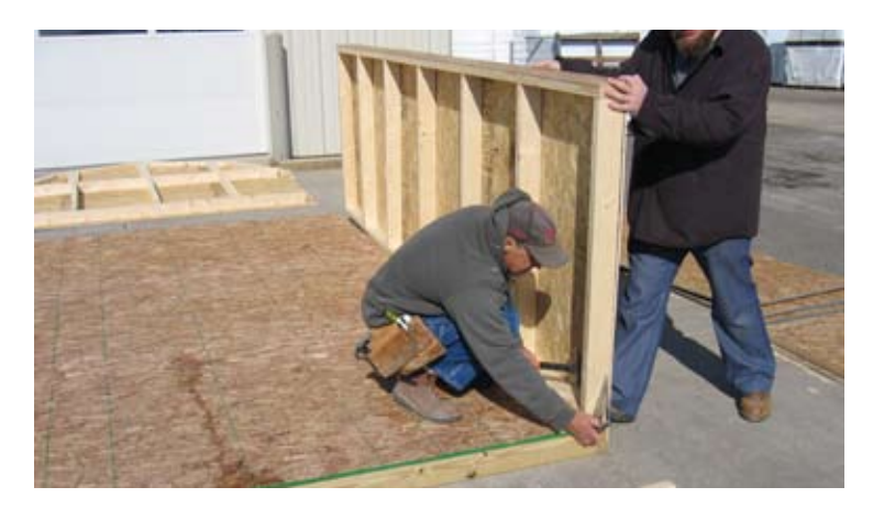
65. Using the WALL LAYOUT DIAGRAM sheet, install the wall, and fasten with 3" nails.