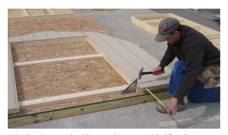
46. Continue with siding and secure with 2" nails.