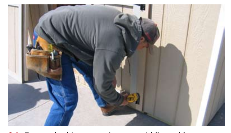
94. Fasten the hinges on the top, middle and bottom.