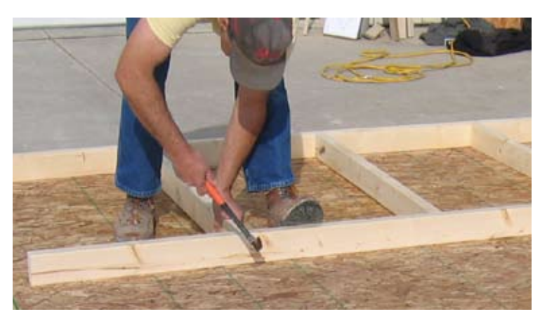
22. Fasten the wall plates and studs together with 3" nails, as shown.