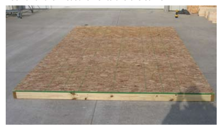
6. Secure the OSB sheeting in place by fastening it with 2" nails to the 2x4's every 6-8 inches.