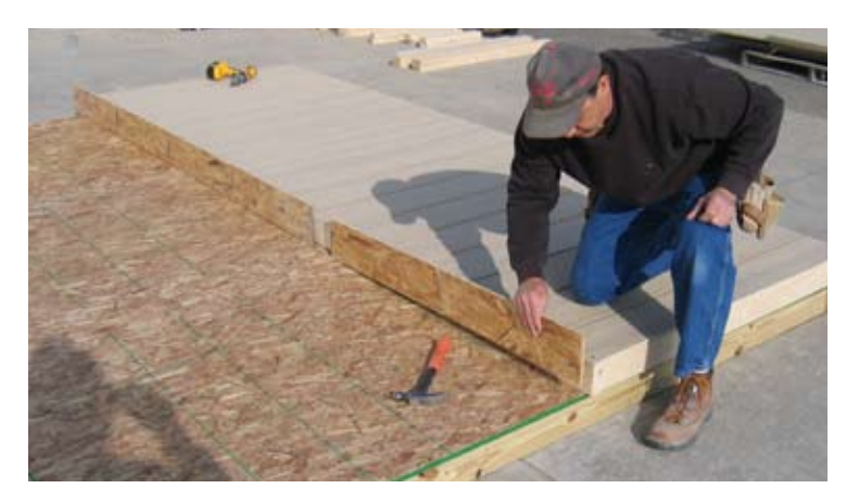
12. Next install 7/16 OSB top plate as shown.