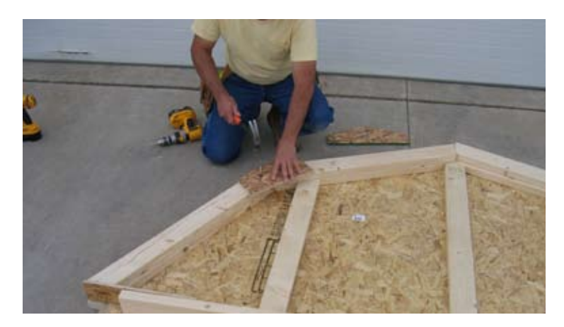
59. Install OSB gussets, as shown, and secure with 2" nails to start truss assembly.