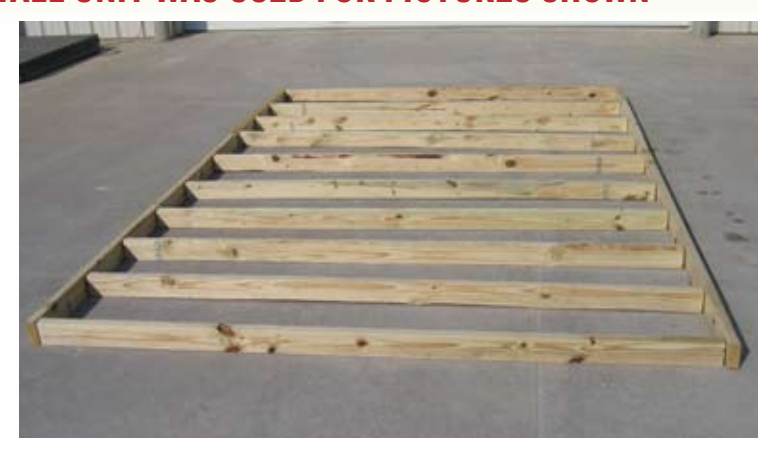
2. Locate your rim boards and floor joist, layout as shown.