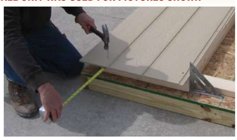
43. Measure 3" from bottom of 2x4, as shown, and secure panel with 2" nails.