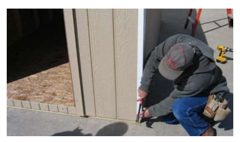
92. Next install aluminum corners and secure with 2" nails.