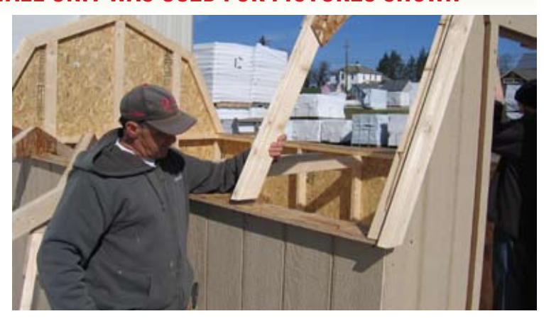
79. Install trusses, as shown, making sure they are 24" on center before fastening.