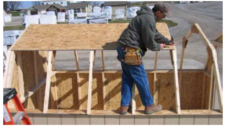
84. Secure with 2" nails as shown.