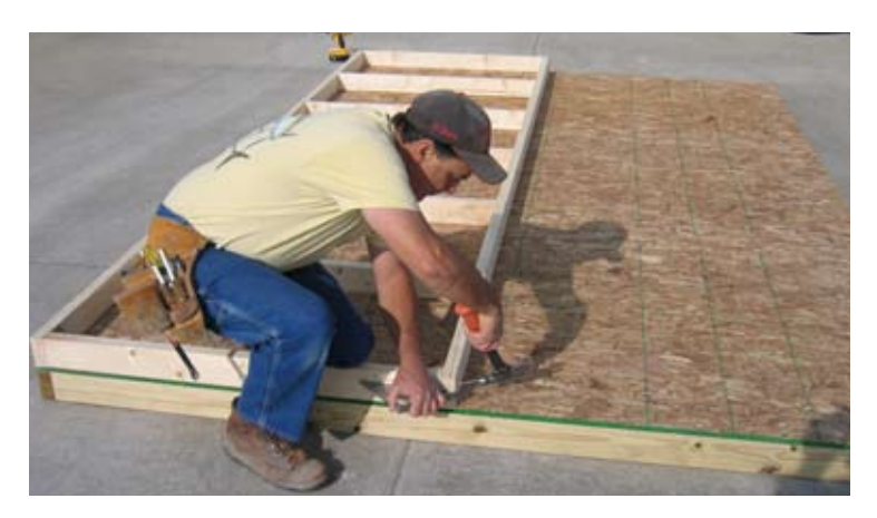
15. Build the next wall as shown.