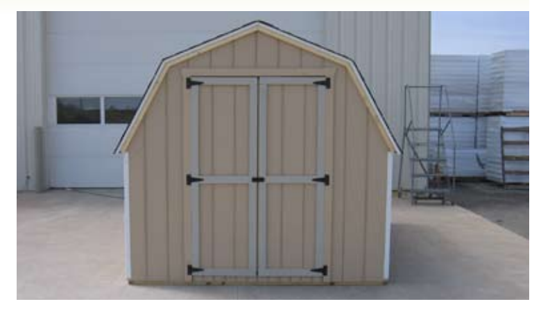
115. Your finished product! (Shown above in the 4' sidewall)

Thank You For Purchasing From Little Cottage Co. ENJOY!