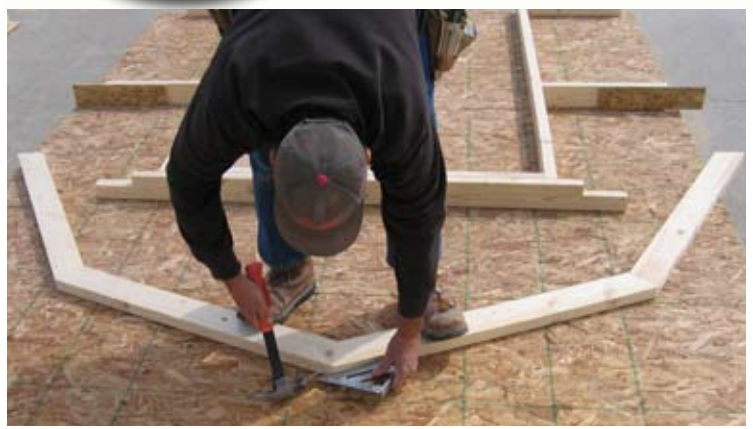
36. Now locate the rafter. See the WALL LAYOUT DIAGRAM sheet to match truss A, B, and C. Secure with 3" nails.