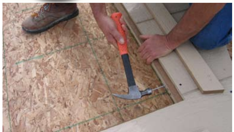
48. Next install the door stops and keep flush with the top of the 2x4 (not Smartside) and secure with 2" nails.