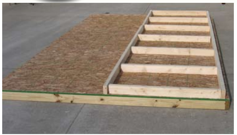
7. Using the WALL LAYOUT DIAGRAM sheet. Locate the 2x4 studs for the wall section and layout as shown.