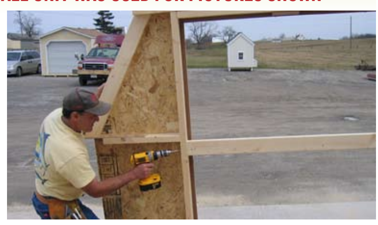
55. Remove 2x4 brace. Top and bottom.