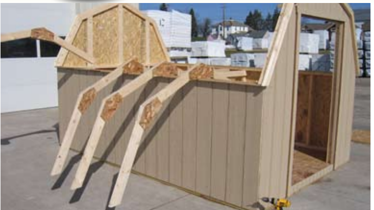
78. Hang trusses on the walls.