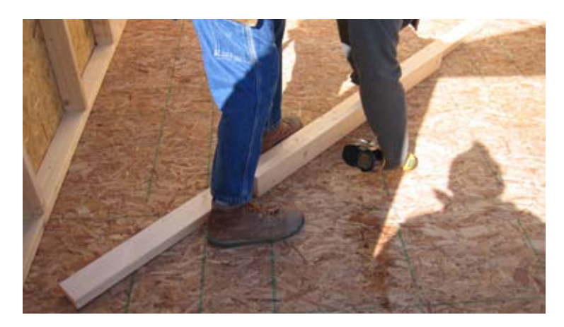
76. Space wall braces according to width of the building and attach with 2 \frac{1}{2} screws.