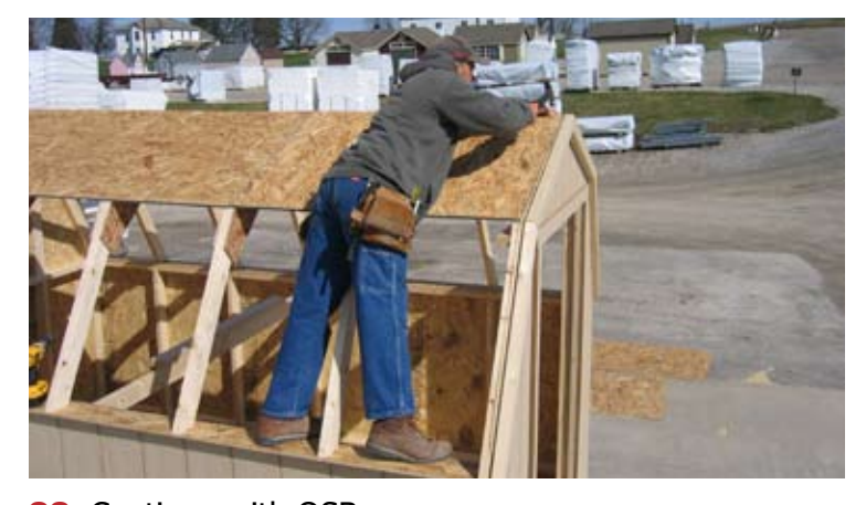
88. Continue with OSB...