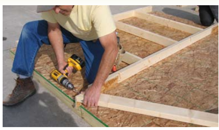
25. Fasten the truss to the temporary piece of OSB, with a 1 1/4" blackheaded screw as shown, repeat on the other side.