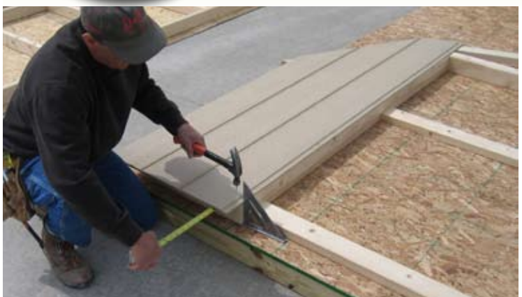
42. Next install Smartside siding. Make sure it is flush on the inside and measures 3" from the plate on the bottom as shown.