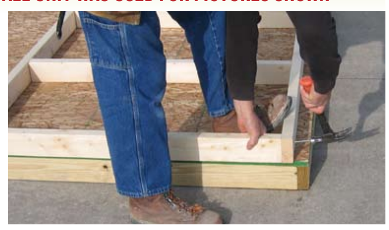
8. To create the interior wall, fasten the 2x4 studs with 3" nails, in between the 2x4 top & bottom plates