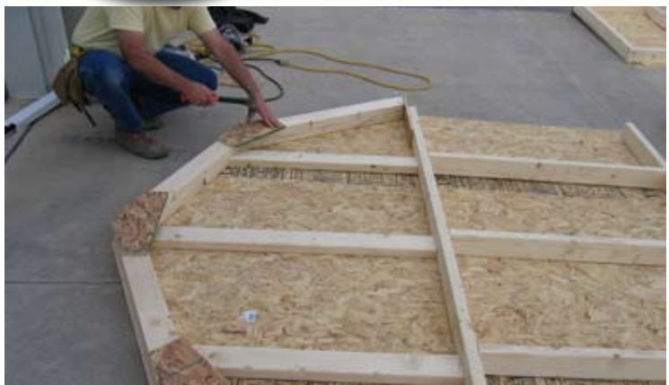
60. Continue installing OSB gussets. See diagram for more information.