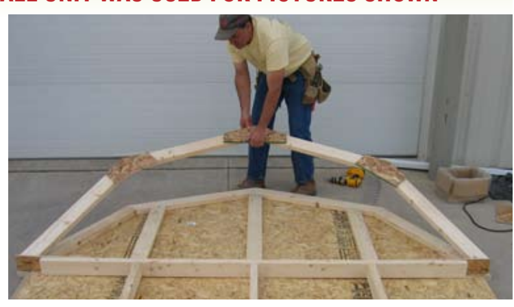
61. Pickup the truss, as shown, and flip it over, to attach the OSB gussets on the opposite side.