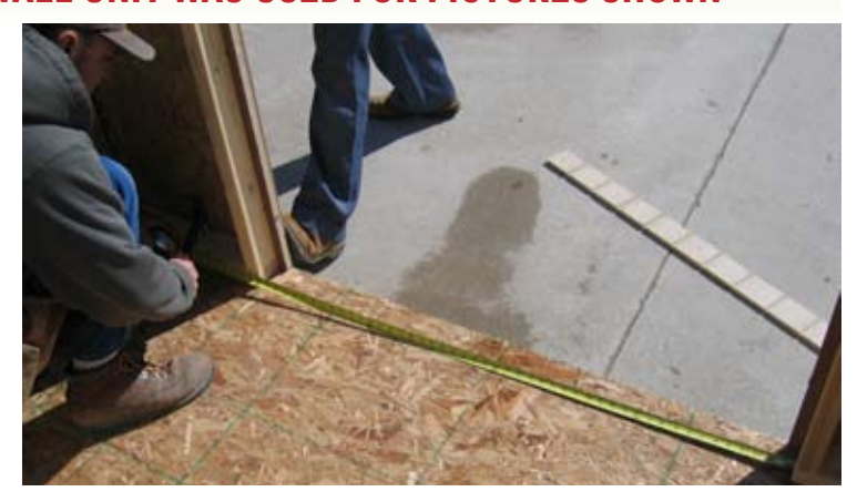
73. Make sure you have 48" or 60" (depending on building width) in between the door opening, 48" on 8' wide buildings and 60" on 10' and wider buildings.