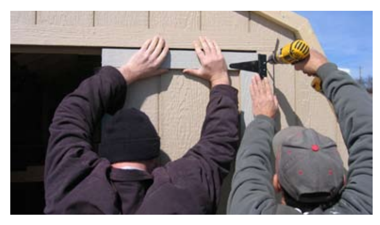
93. For door installation, you will be using three hinges, per side. Use one 2 1/2" blackheaded screw, per hinge. Fill the remaining screw holes with 1 1/4" screws. This is done for both sides.