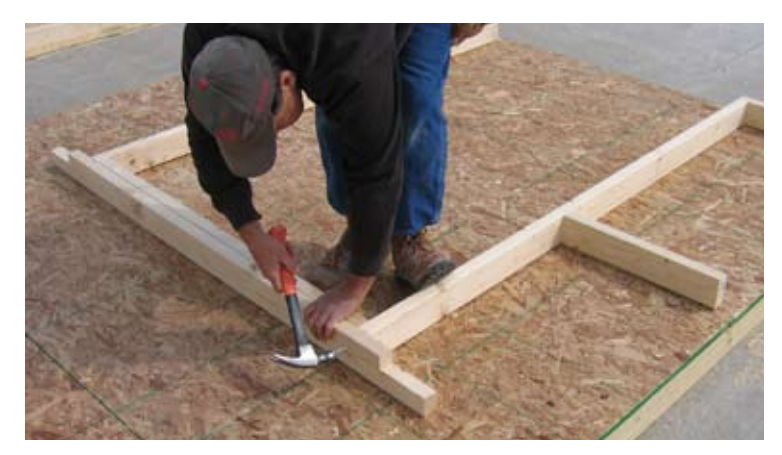
34. Install the 2x4 with notch, on top of the header. Secure with 3" nails.