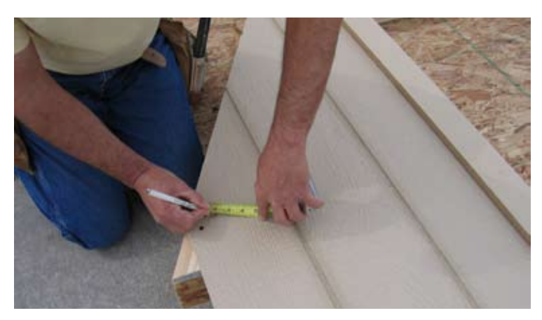
51. For rake installation, measure 2 1/2" from the edge of the Smartside, and mark with pencil, as shown.