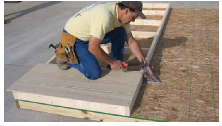
17. Make sure that you always fasten the top first and keep flush with the 2x4 top plate.