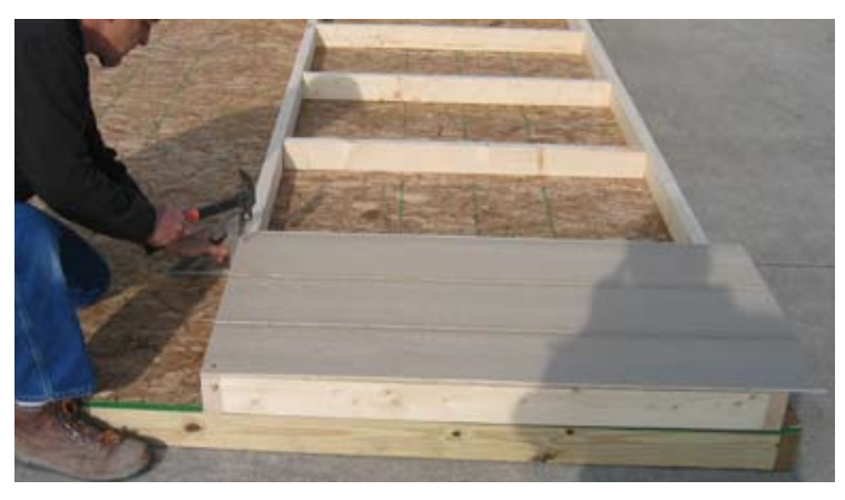
10. Always fasten the top first and keep flush with the 2x4 top plate.