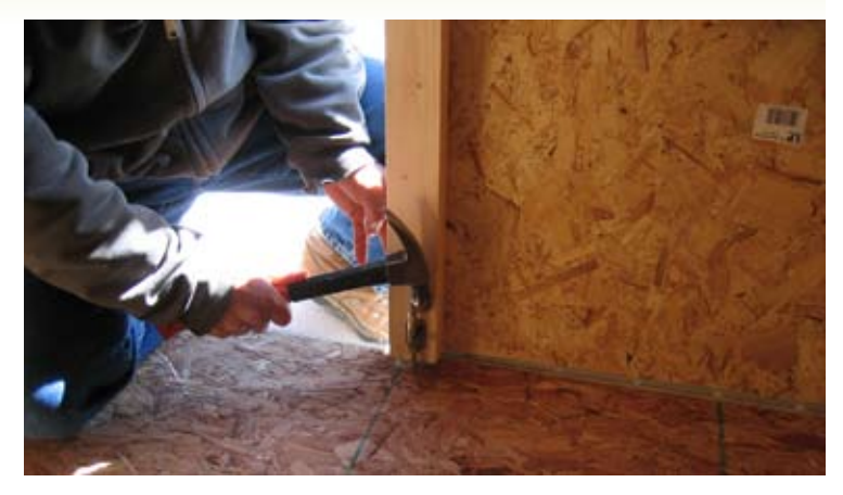
97. Use your hammer to tap on the barrel bolt to locate the mark.