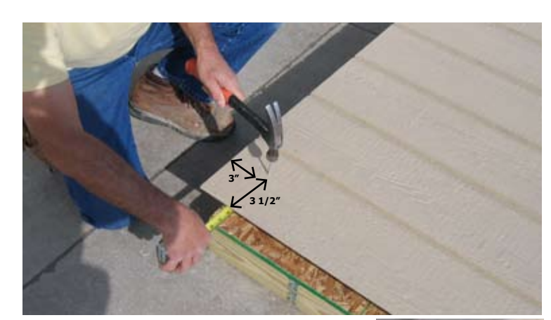
29. Next, install the Smartside siding. Place the siding 3" down from the bottom plate and 3 1/2" over from the side of the bottom plate.