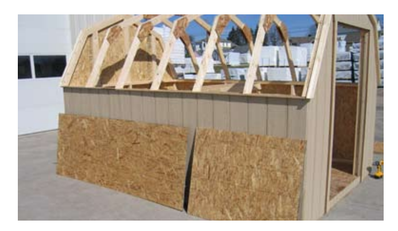
81. Locate OSB sheeting for the roofing.