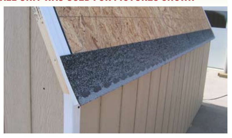
109. Continue as shown.