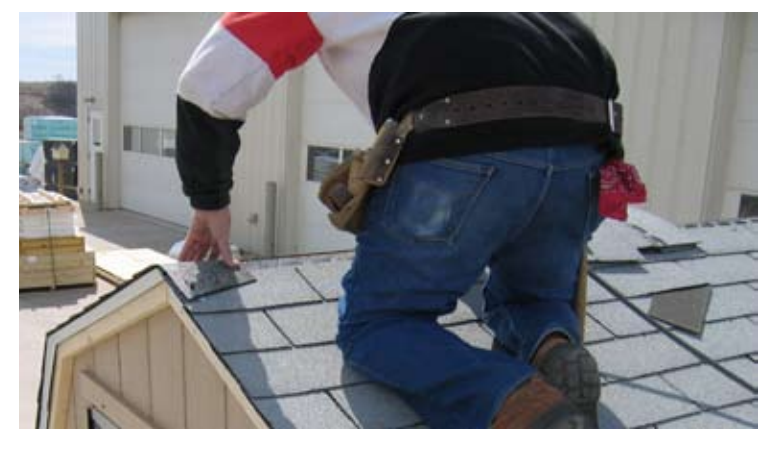
112. Cut the ridge cap as shown and start to place the cap on the top of the building.