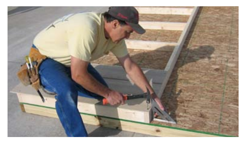
16. Continue installing Smartside siding, making sure all is flush.