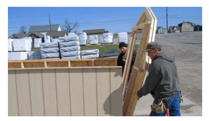
71. Install the front gable.