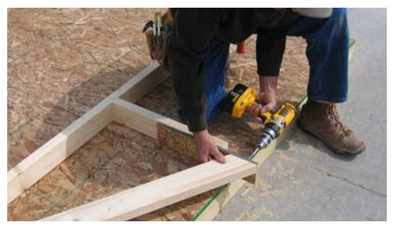
38. Make sure the truss is flush on top and outside with the OSB before fastening.